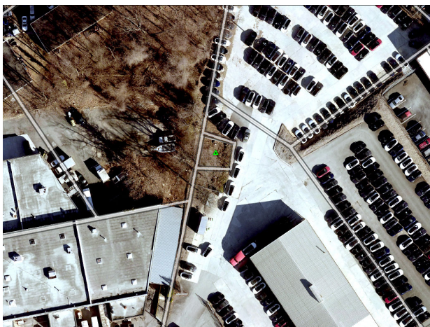
HP-249-01 Cemetery location on 2025 Aerial Photograph

Date: 03/05/2026