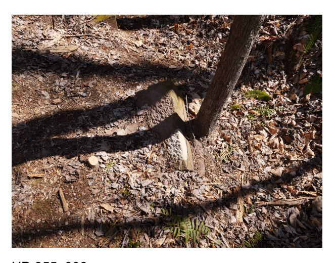
HP-355_006 Browning cemetery marker base

Date 03/07/2023