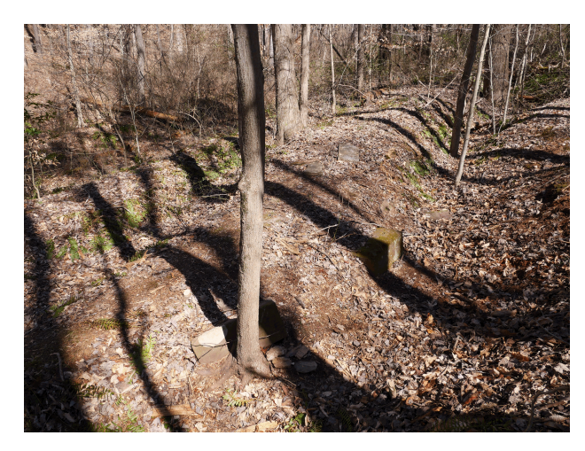
HP-355_005 Area of headstones facing northeast

Date 03/07/2023