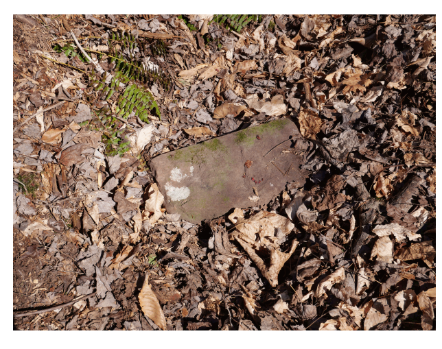
HP-355_009 Browning cemetery marker base

Date 03/07/2023