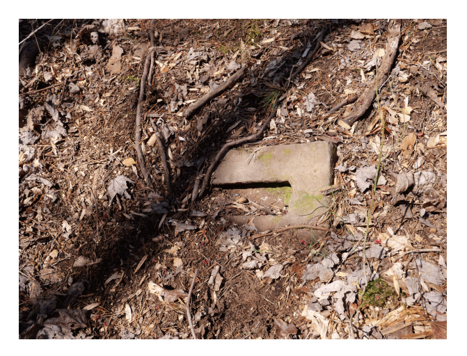
HP-355_008 Browning cemetery marker base

Date 03/07/2023