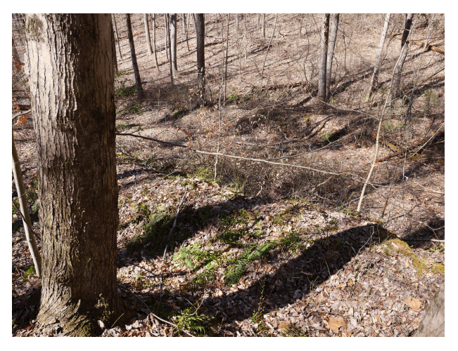
HP-355_010 Area of headstones facing west, showing nearby road trace

Date 03/07/2023