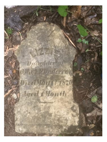
HP-355_004 Browning cemetery - Lizzie