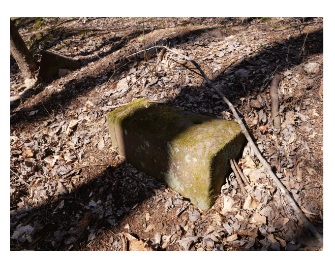
HP-355_007 Browning cemetery marker base

Date 03/07/2023