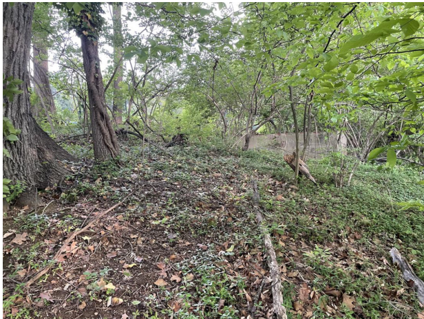
HP-359-03 Cemetery Area Facing southeast

Date 07/26/2023