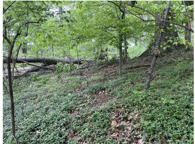
HP-359-02 Cemetery Area Facing northeast