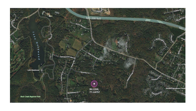
HP-020-002 Aerial Map

Date 03/12/2018