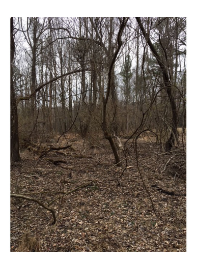
HP-020-003 Entry from service road used by WSSC

Date 03/12/2018