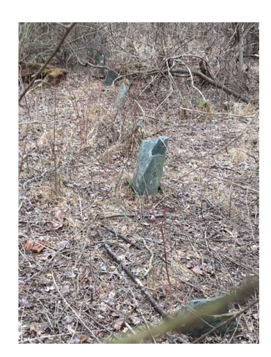
HP-020-004 Possible stone perimeter fence line

Date 03/12/2018