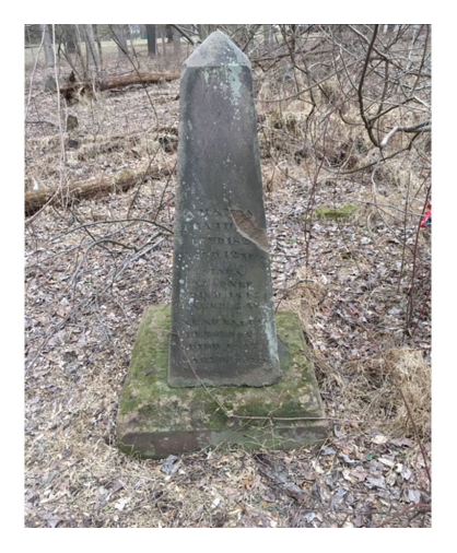
HP-020-005 Obelisk Monument

Date 03/12/2018