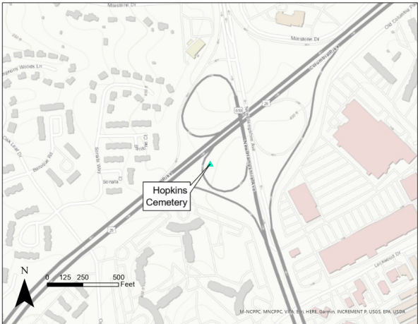
HP-157-01 Location of Cemetery

Date 04/07/2025