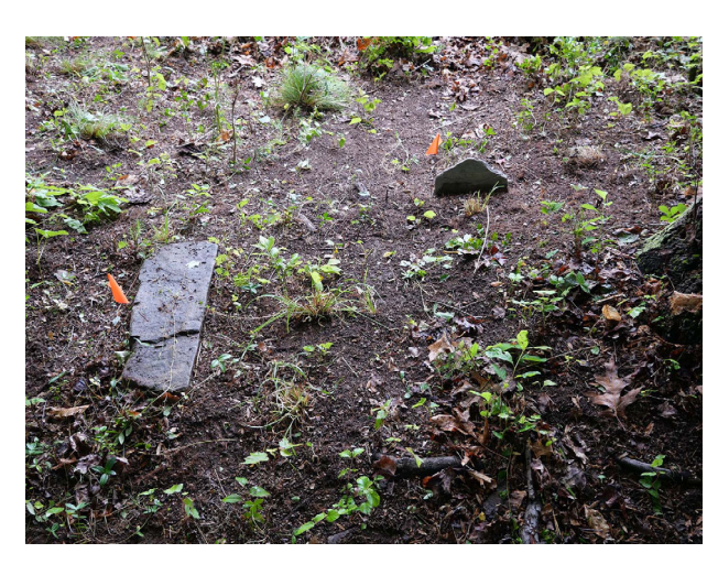
HP-294-08 Example Markers

Date 05/29/2019