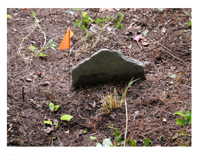
HP-294-07 Example Marker

Date 05/29/2019