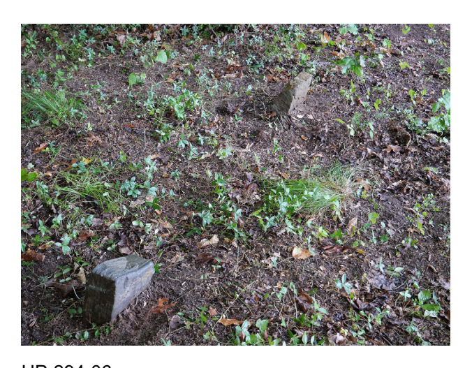
HP-294-06 Example markers

Date 05/29/2019