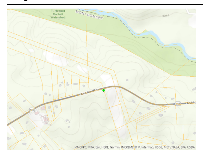
HP-294-01 Cemetery Location

Date 03/04/2022