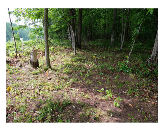
HP-294-03 Edge of Cemetery, facing south

Date 03/04/2022