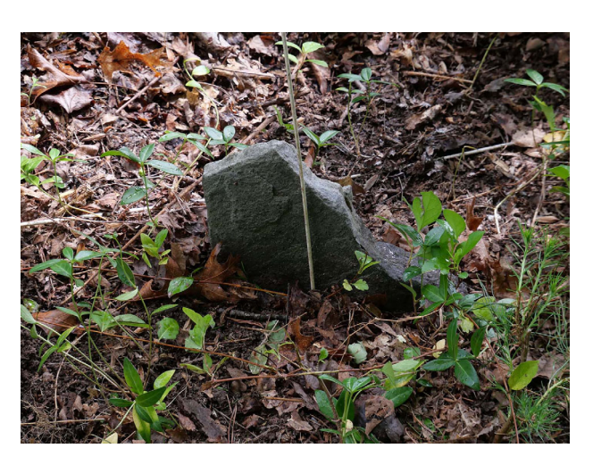
HP-294-04 Example Marker

Date 03/04/2022