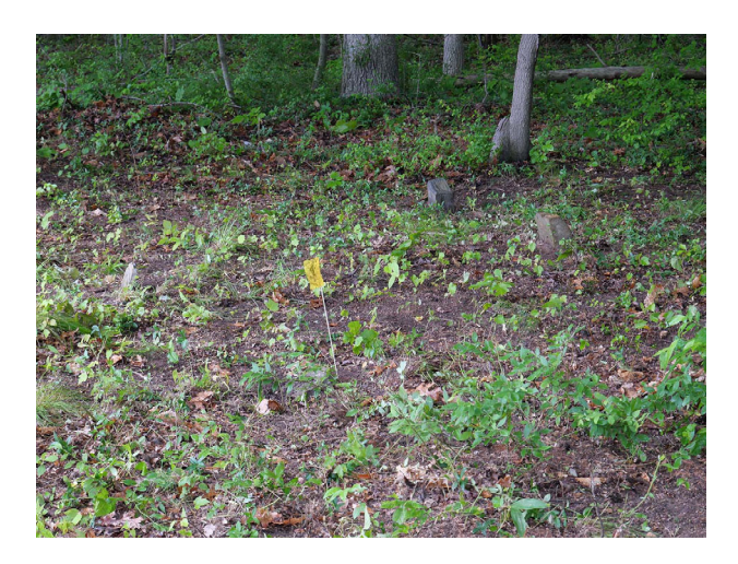
HP-294-05 Markers, facing south

Date 05/29/2019