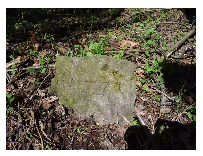
HP-319-18 Fieldstone with polygon carving