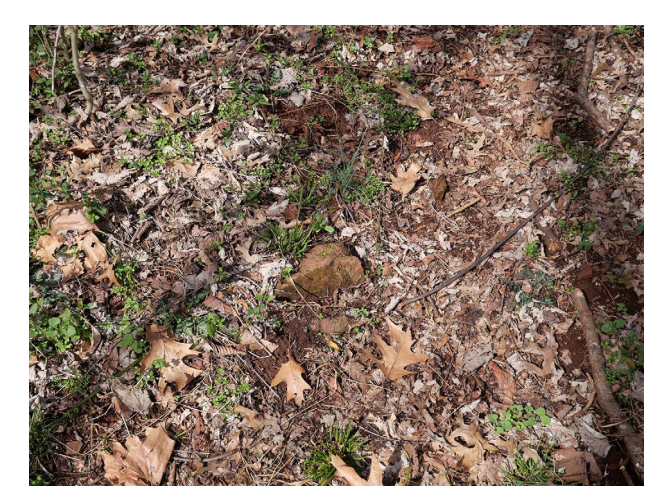
HP-319-10 Unmodified fieldstone marker

Date 03/13/2020