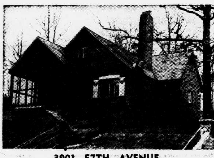
3901 57TH AVENUE