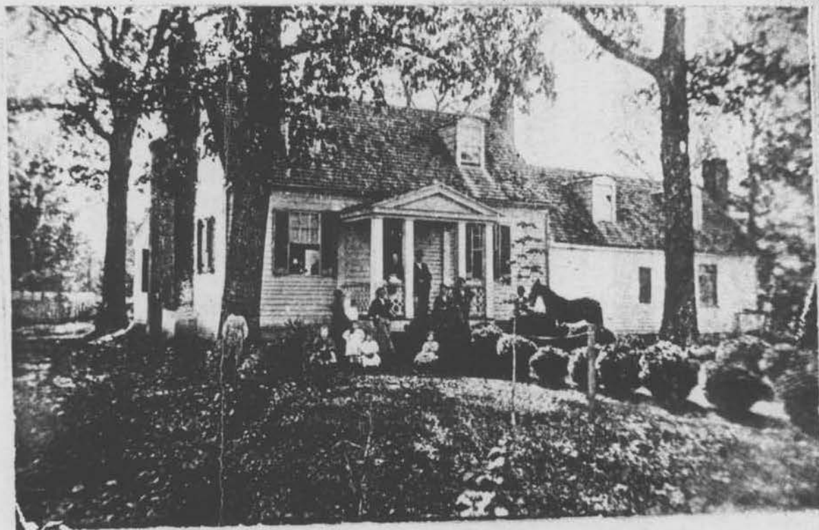
PHOTO DATED 1873 BY PRETTYMAN FAMILY PHOTO - MONT. CO. HISTORICAL SOCIETY

104 West Jefferson before 1876 (tentatively dated by family Fall, 1873)