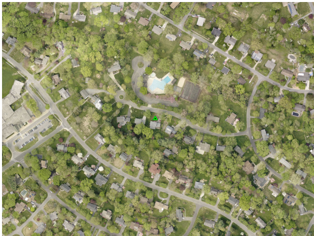
HP-165-02 2023 Aerial photograph of cemetery location

Date 09/30/2025