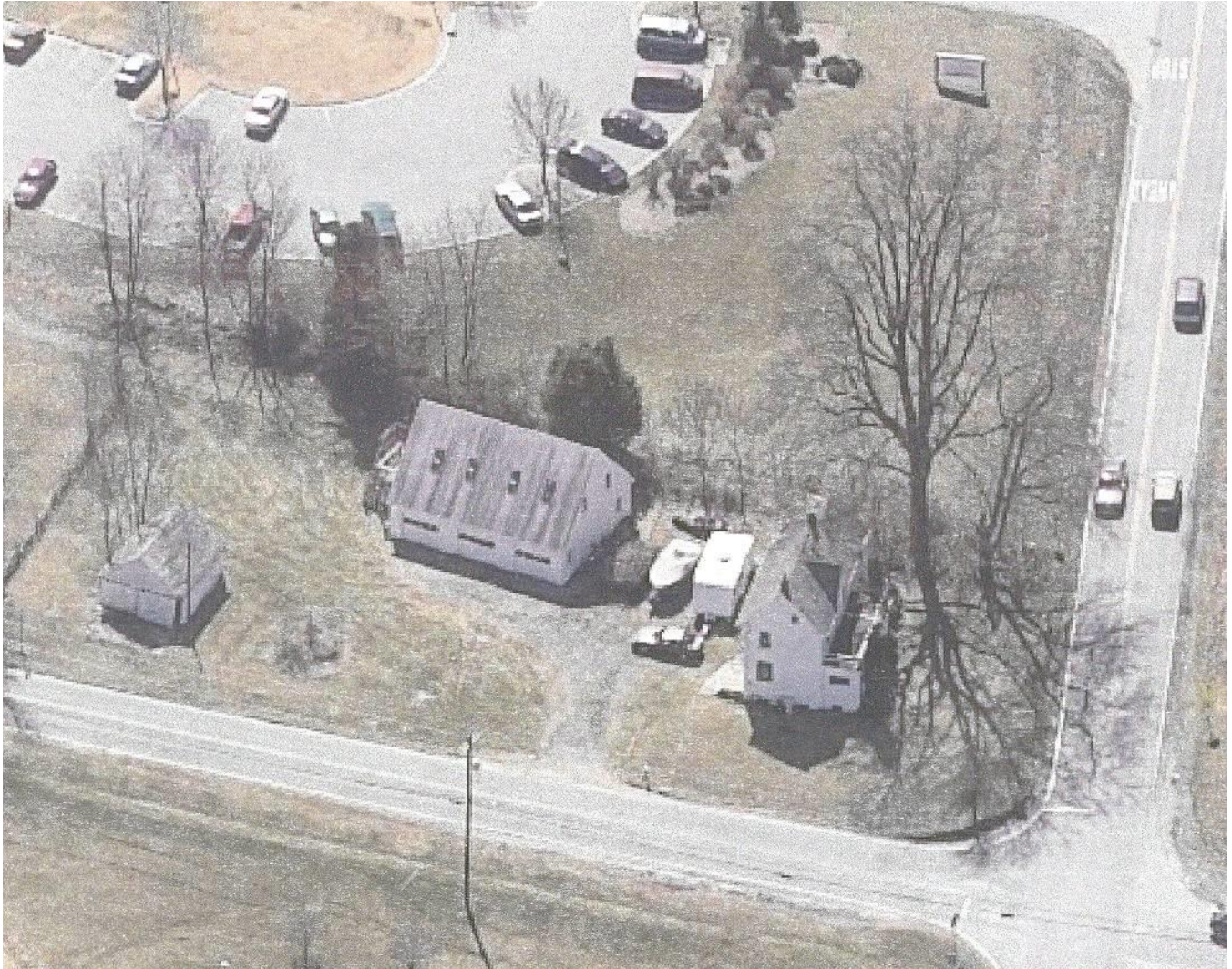
2003 Aerial view: North facade of Black and White Inn