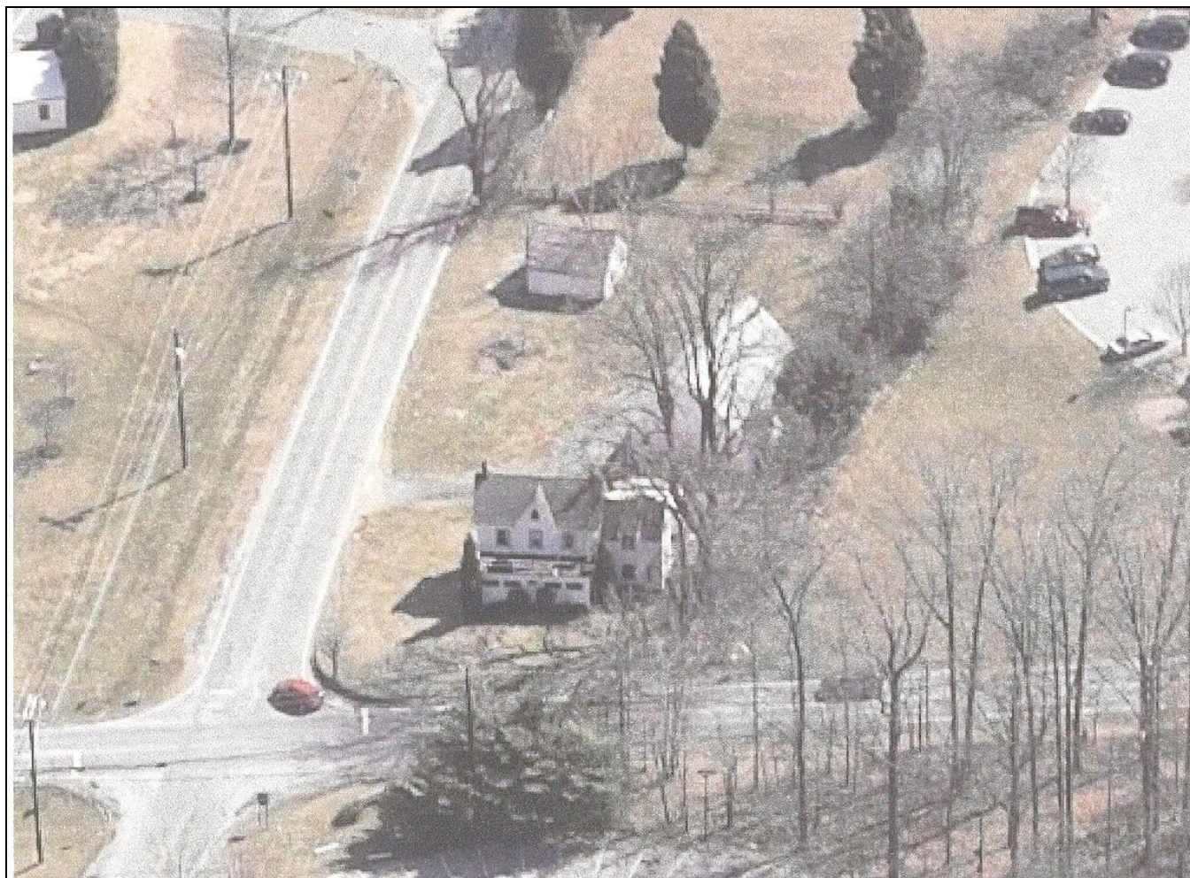
2003 Aerial: East (front) façade of the Black and White Inn