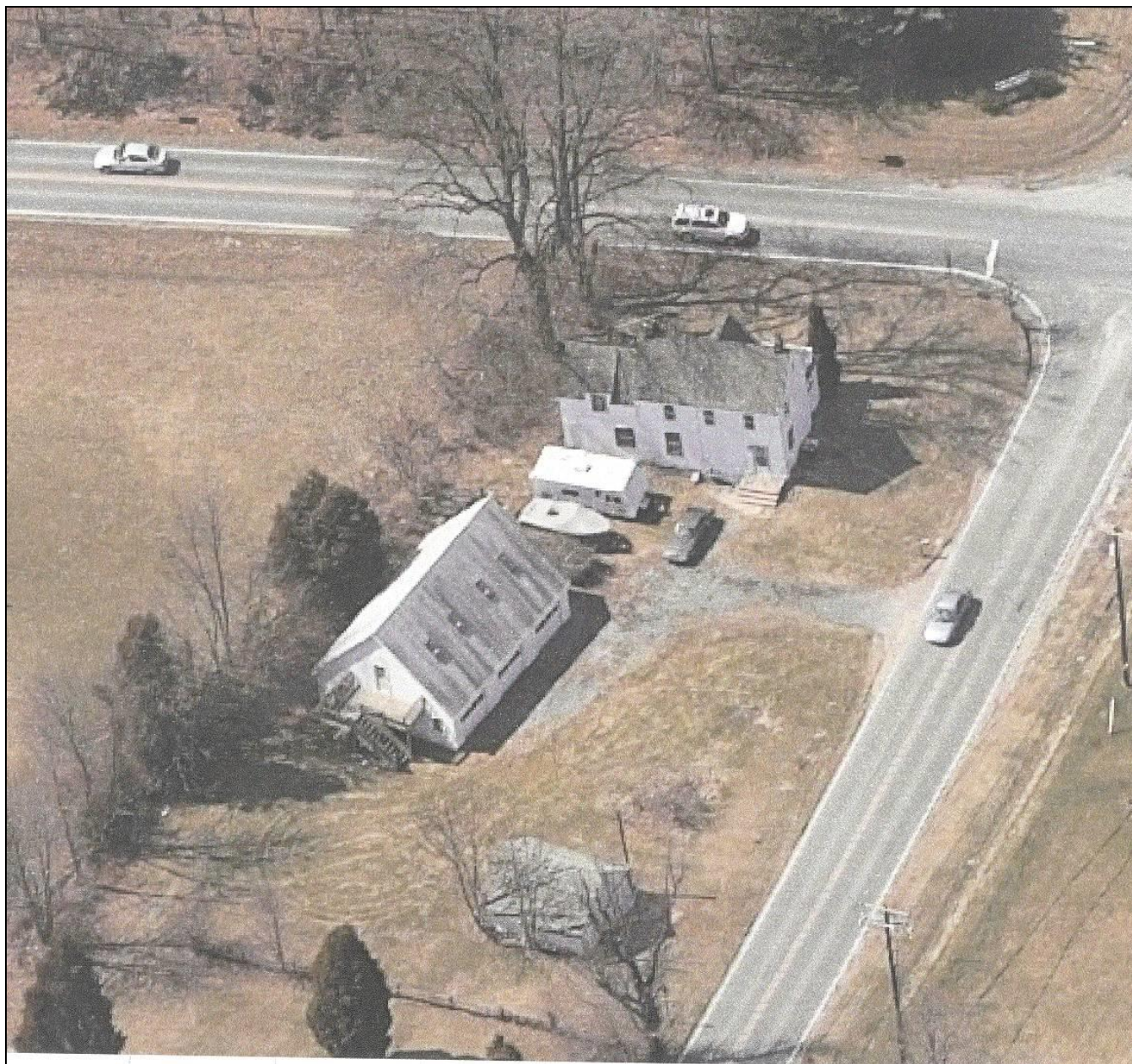
2003 Aerial view: East facade of the Black and White Inn,