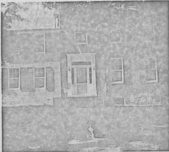
NO. 21 F-10 SAMUEL BONIFANT CA. 1790/1800 BRICK

T HIS compact little brick house is located on a large farm a half-mile west of Colesville and fifteen miles from the Zero milestone. It is on parts of original land grants of Drumaldry which contained 225 acres made to James Beall in 1716, and Wolf's Den an early