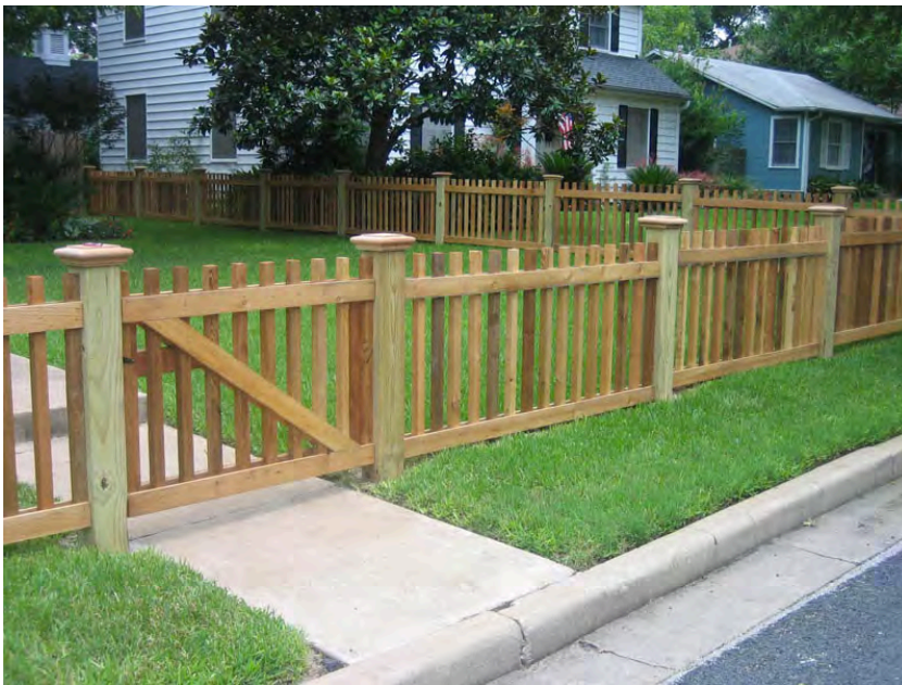
Front (picket style)