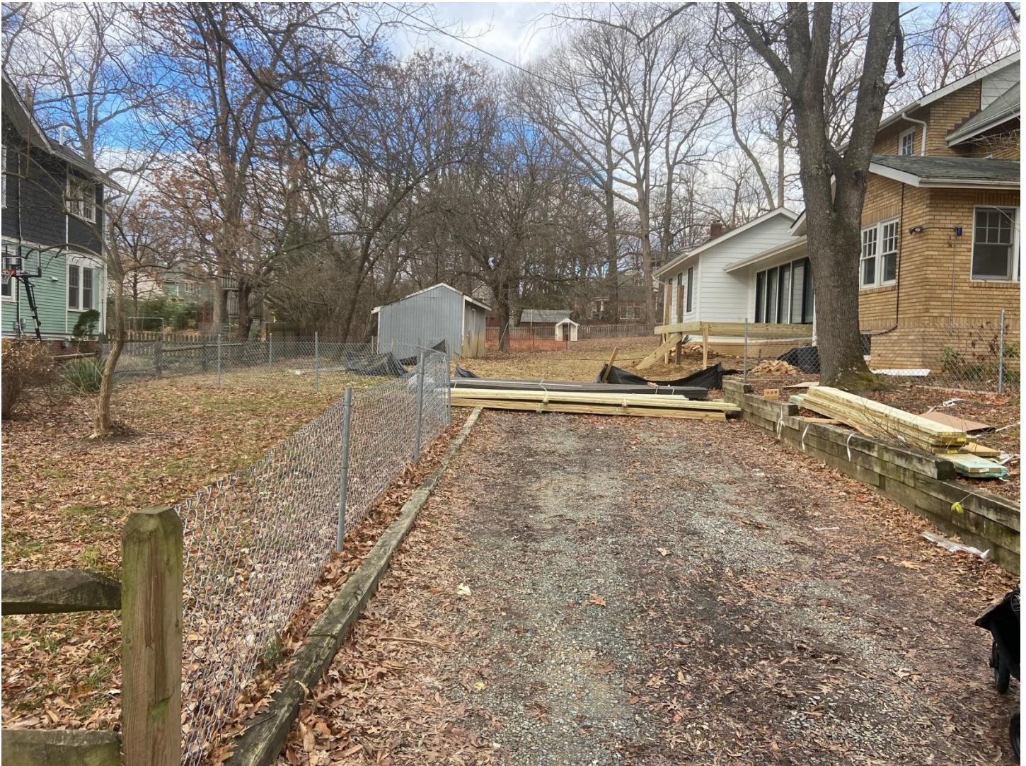
View of the accessory shed structure from the sidewalk along Takoma Ave at driveway.