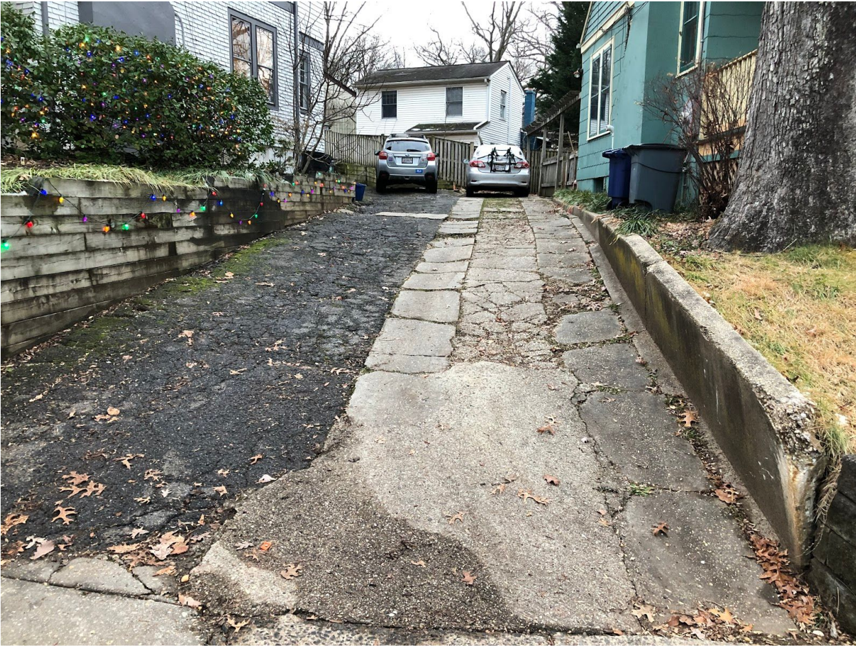
Driveway and left side retaining wall