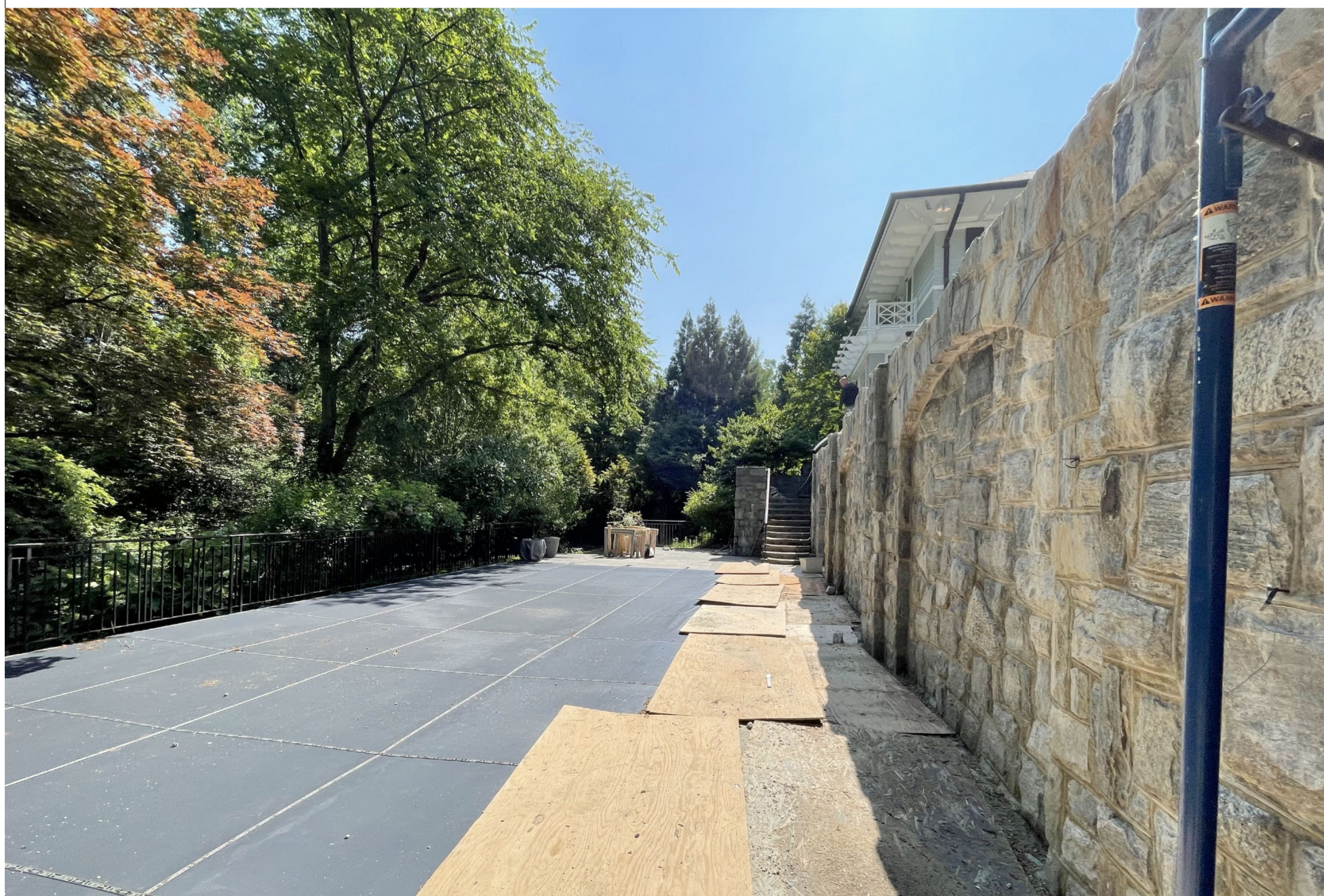
EX. UPPER POOL TERRACE