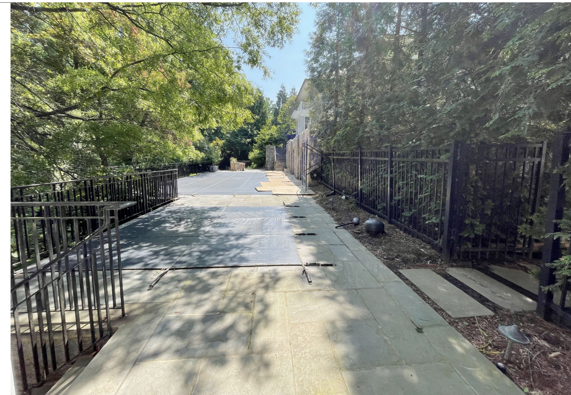
EXISTING SPA & POOL TERRACE