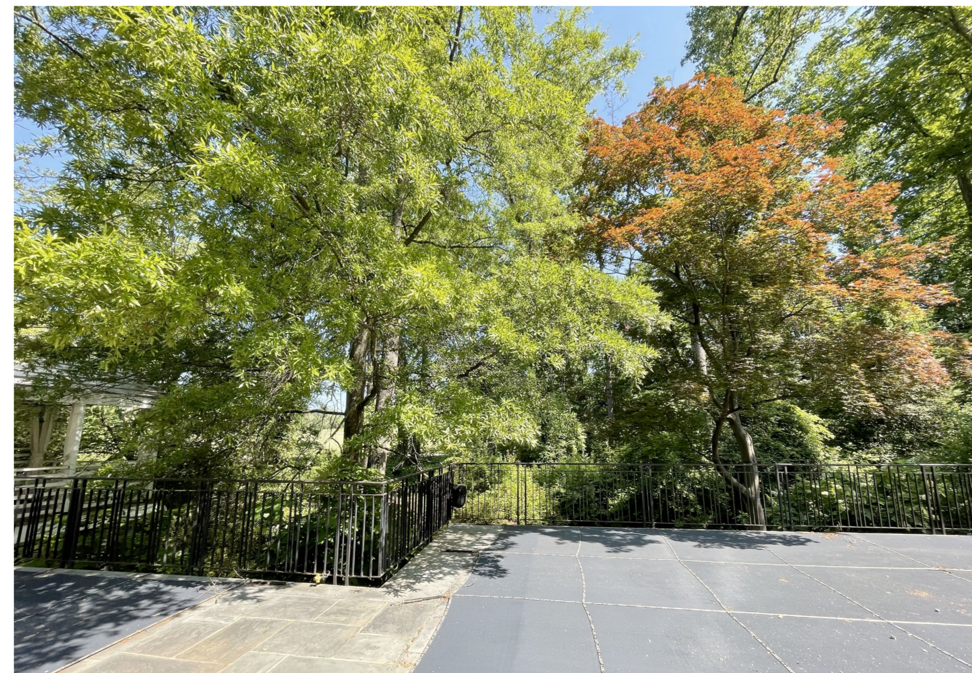
EXISTING POOL & SPA TERRACE