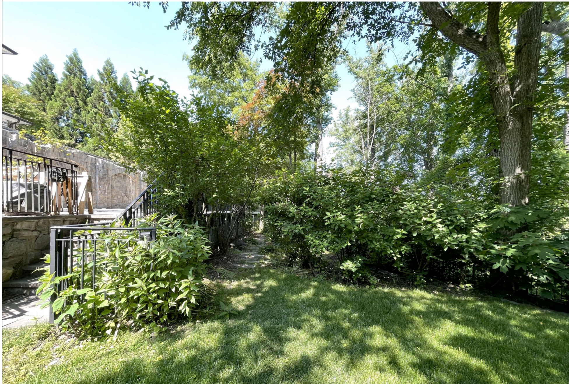
EXISTING STAIRS TO POOL TERRACE