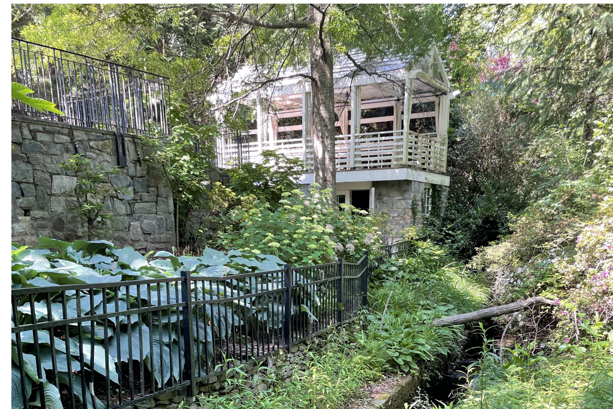
EXISTING STREAM TOWARD END OF REAR PROPERTY LINE