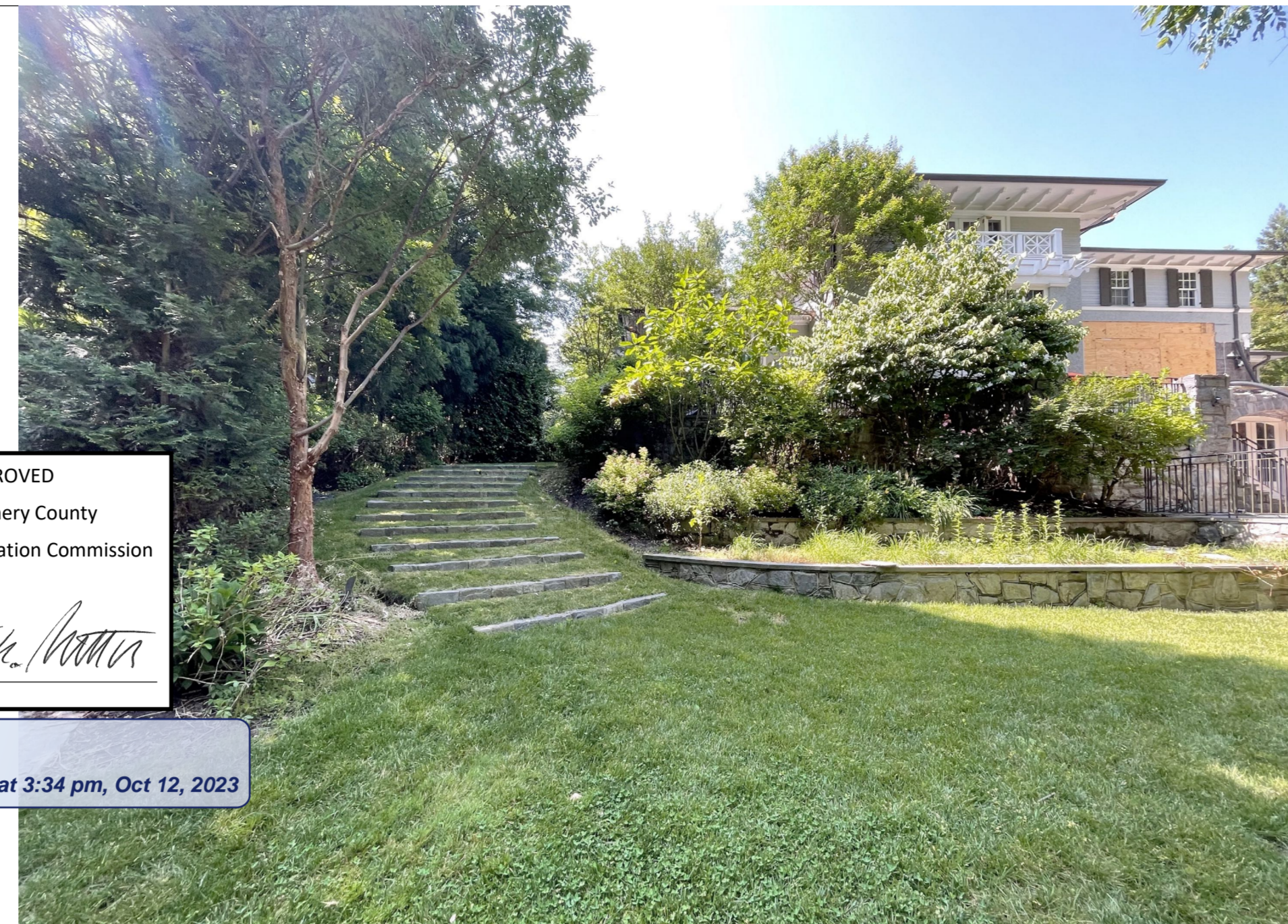
EX. LAWN STEPS TO REAR LAWN