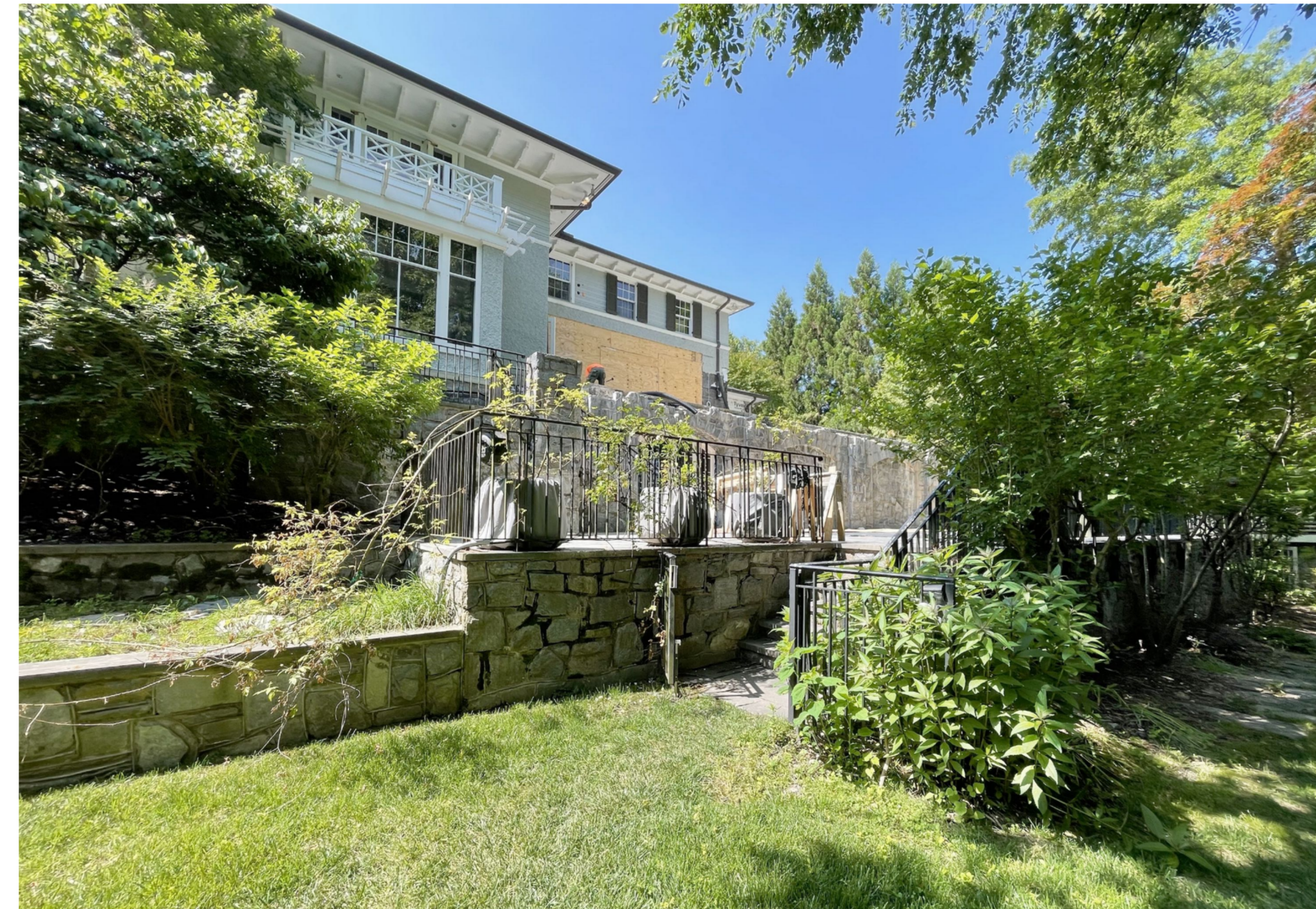
EXISTING STAIRS TO POOL TERRACE