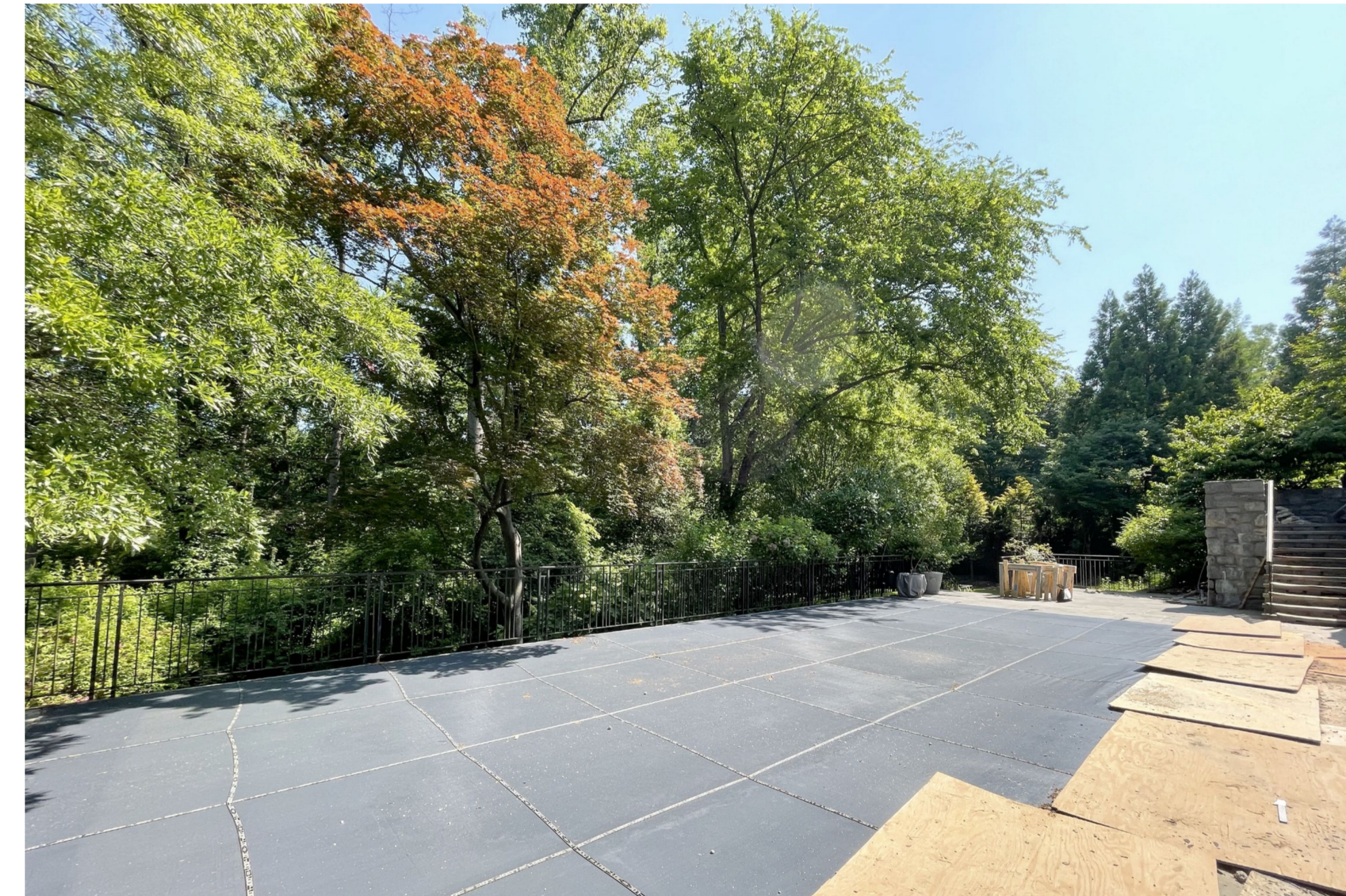
EXISTING POOL TERRACE AND STAIRS TO UPPER TERRACE