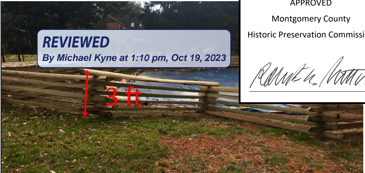
Example of split rail fencing to be installed around Oakley Cabin's archaeological site (example from Josiah Henson Museum and Park), showing elevation of the fence.