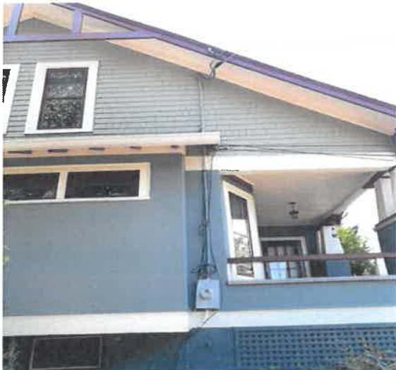
Utility Side Before Installation