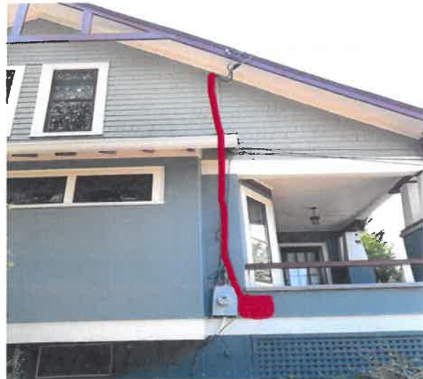
Utility Side Example After Installation