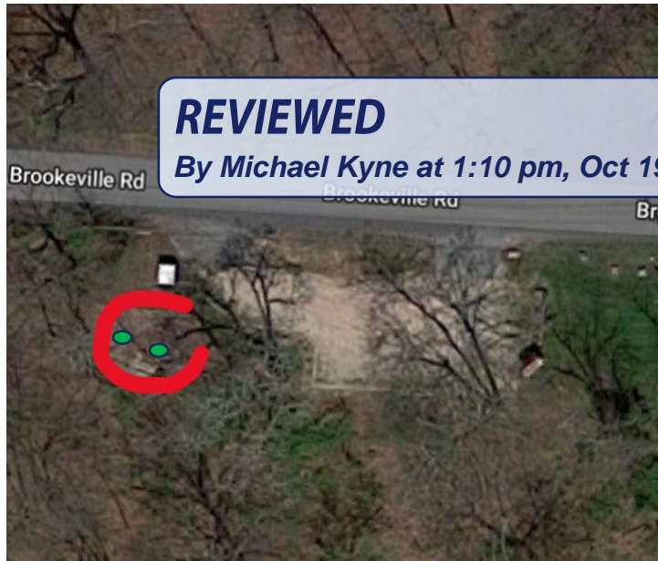
Location of split rail fencing installation around the Oakley Cabin archaeological site. The green ovals show the approximate locations of the 10" Black Locust and 14" Catalpa trees which will be removed.