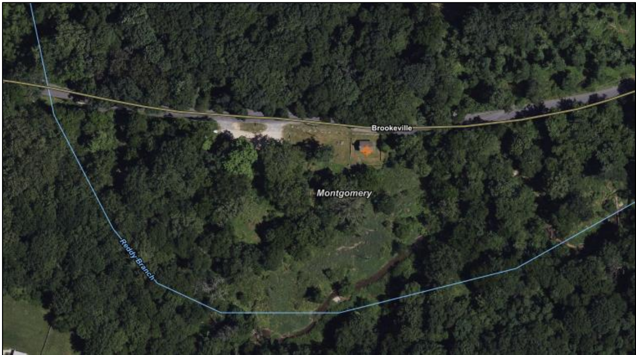
Location and setting of the Oakley Cabin African American Museum and Park, 3610 Brookeville Road, Brookeville, MD. Picture shows forested area, mowed area, and parking lot.