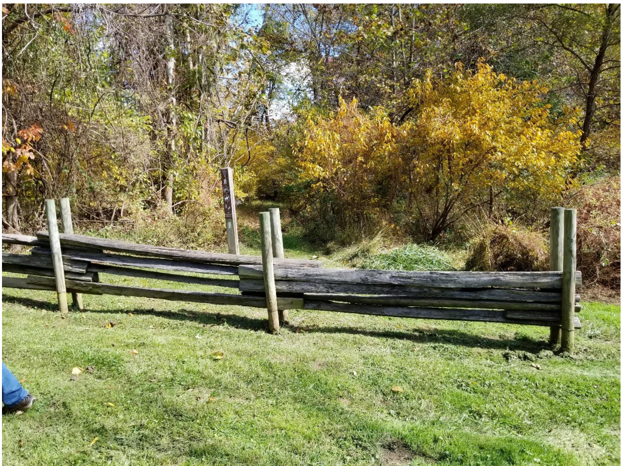
Split rail fence on the eastern trail side of Oakley Cabin, facing E (these two sections will be removed).