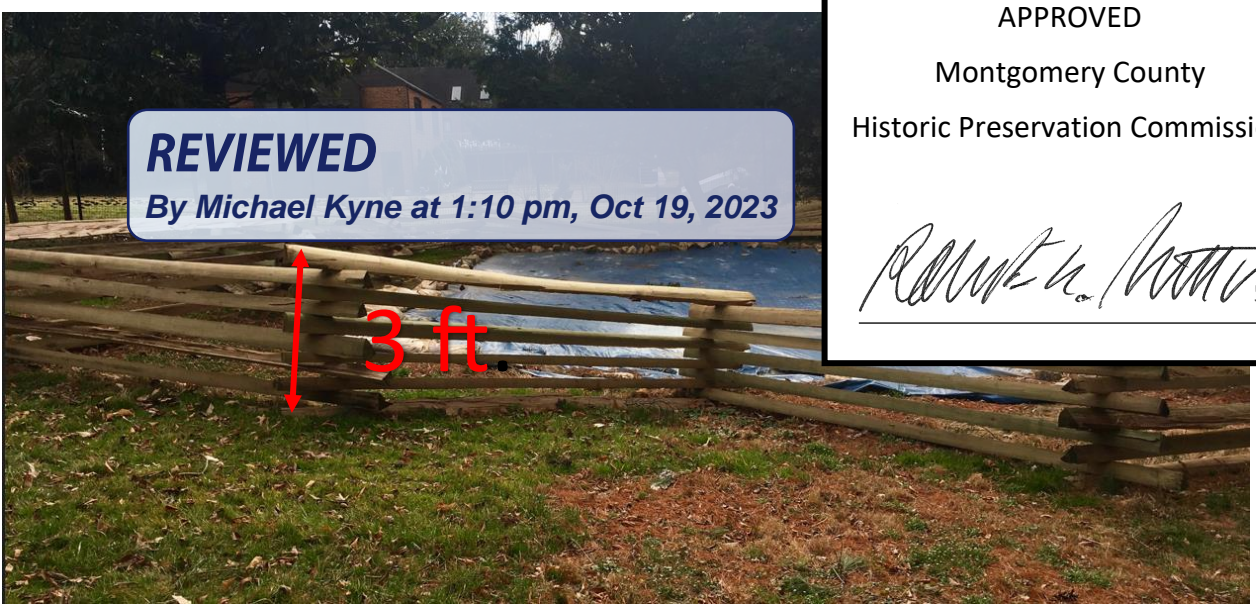
Example of split rail fencing to be installed around Oakley Cabin's archaeological site (example from Josiah Henson Museum and Park), showing elevation of the fence.