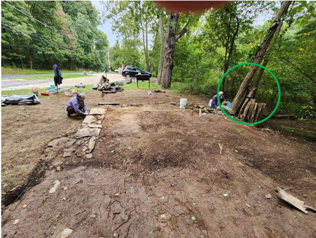
Oakley Cabin Foundations, facing East. Note the interpretive sign and Oakley Cabin in background. Green circle shows stump and 10" Black Locust Tree which will be removed.