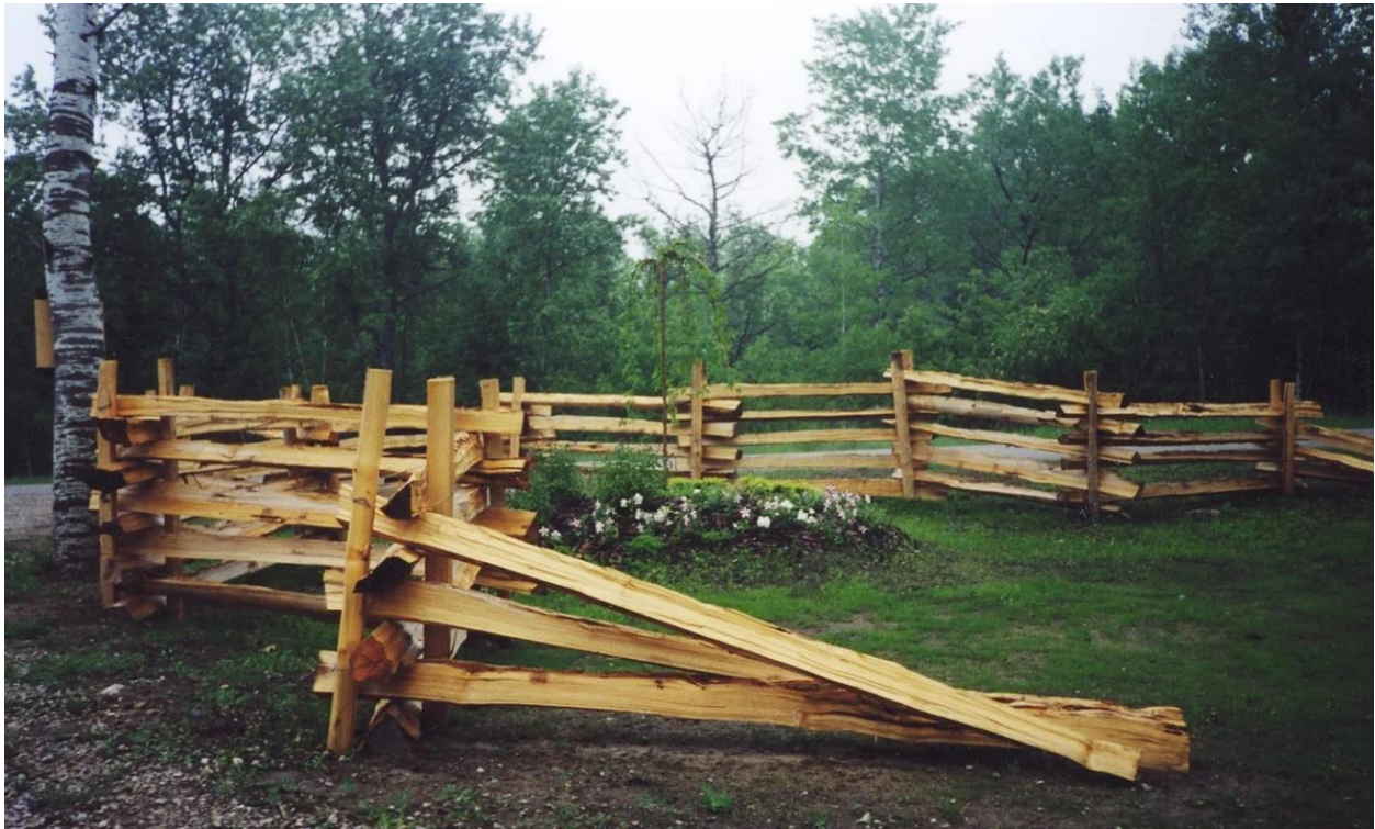
Example of split rail fencing end near opening ( https://www.cedarsplitrails.com/snake-zig-zag-cedar-rail-fences?lightbox=dataitem-jug0jrkv accessed 10/10/2023)