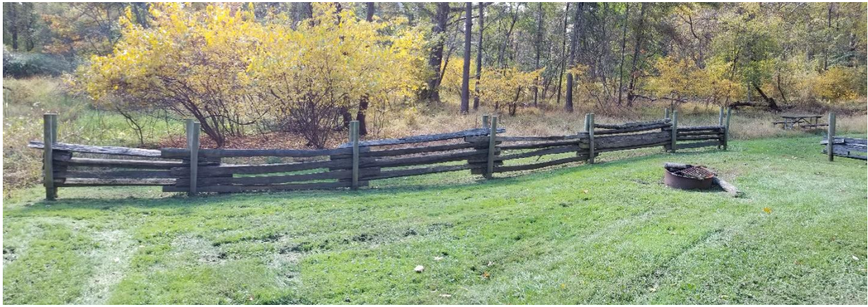
Split rail fence at the back of Oakley Cabin facing SW (will be completely removed).