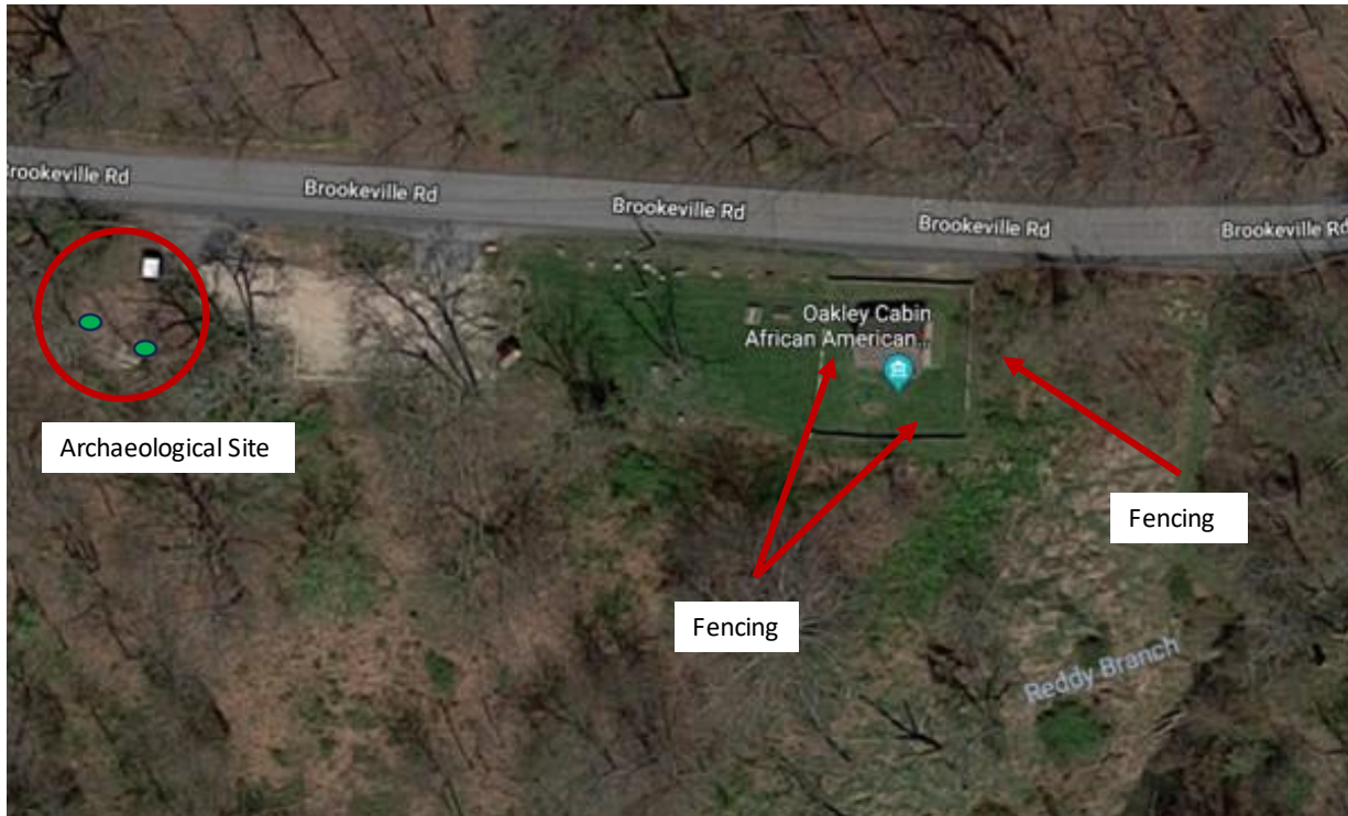
Site Plan of Oakley Cabin archaeological site fencing project location and the fencing around the cabin. The green ovals show the approximate locations of the 10" Black Locust and the 14" Catalpa trees which will be removed.