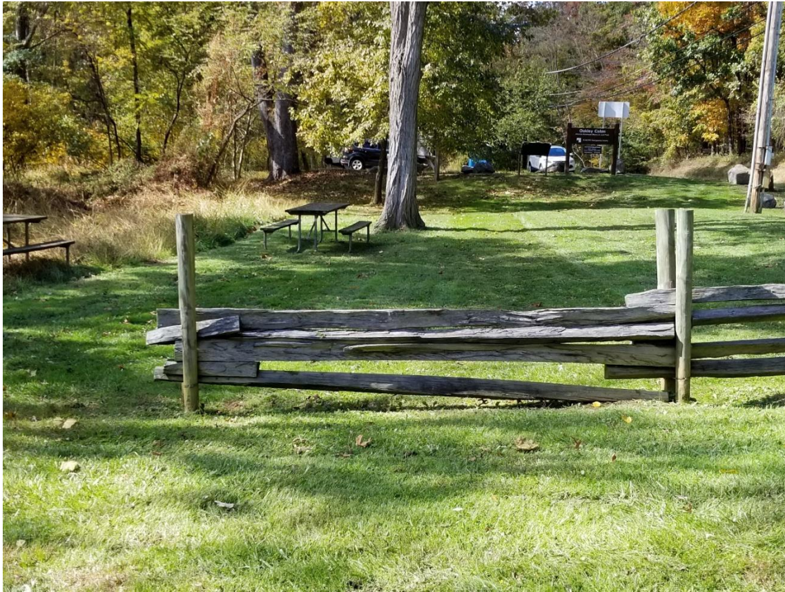
Split rail fence on the western parking lot side of Oakley Cabin, facing W (one section to be removed).