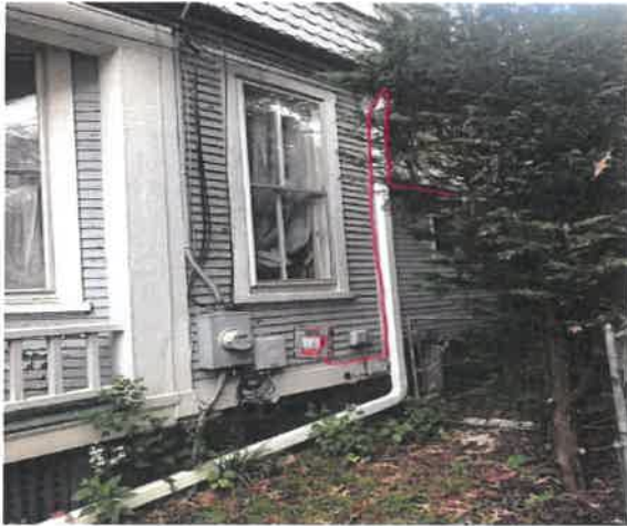
Utility Side Examples After Installation