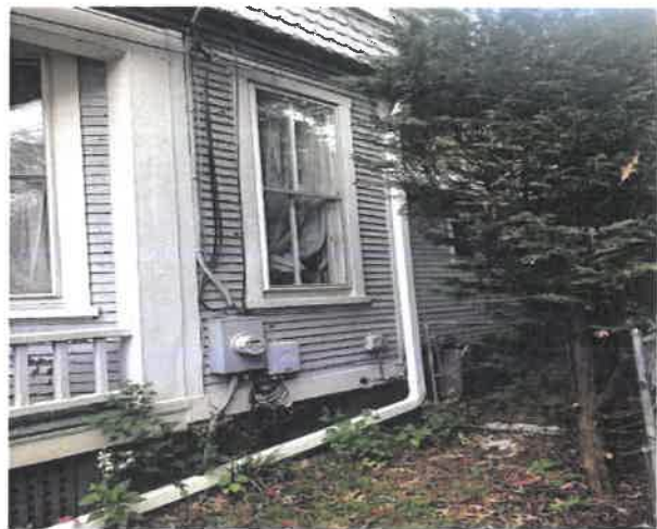
Utility Side Before Installation