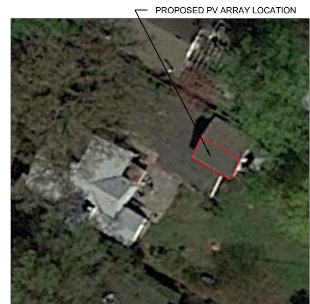
SOLAR PANEL LAYOUT Scale: 3/16" = 1'-0"

Drawn by: Gordon Allen Date: 14-OCT-2020 Scale: AS NOTED Sheet: A001 9