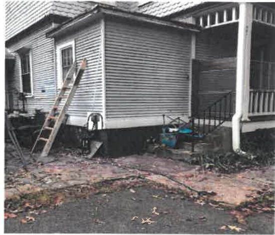
Proposed EV Charger (back of home)