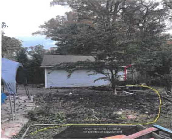
Garage Side (with underground conduit path)