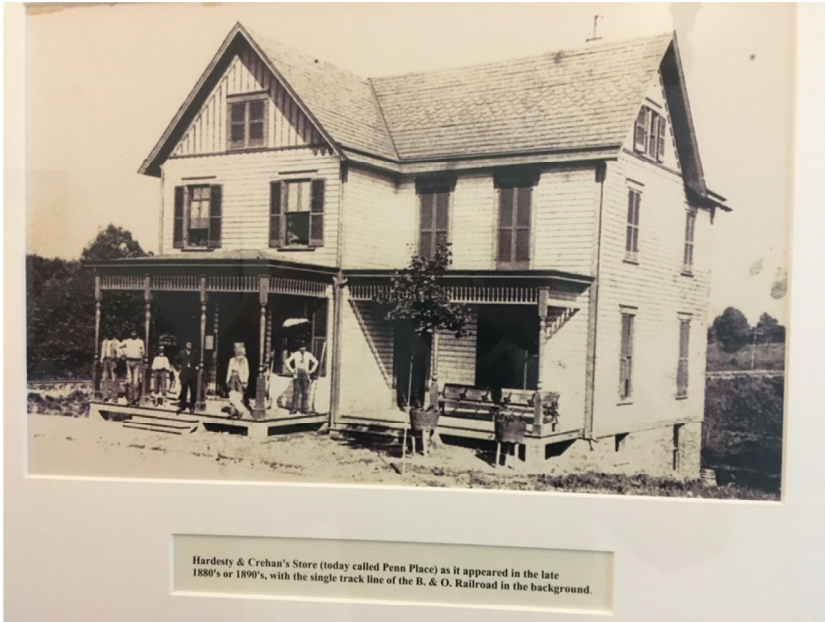
Hardesty & Crehan's Store (today called Penn Place) as it appeared in the late 1880's or 1890's, with the single track line of the B. & O. Railroad in the background.