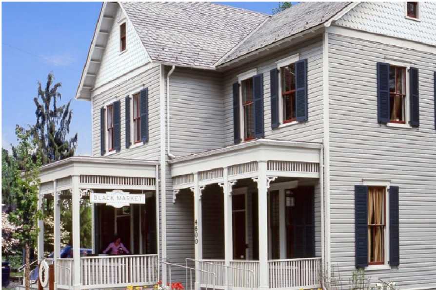
Picket railing to match the smaller porch on right side