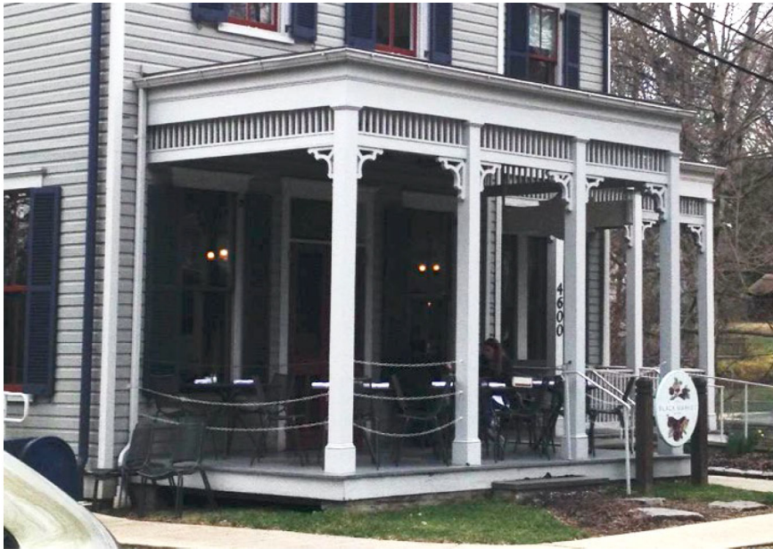
Existing chains around porch