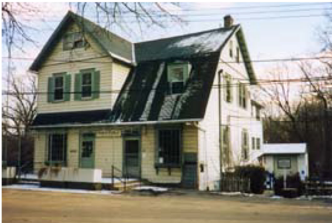
Penn Place before the 2004 renovation (date unknown)