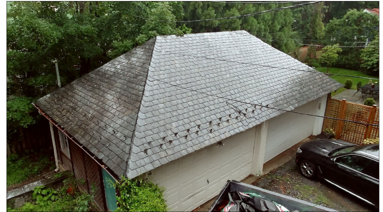
EXISTING SHARED GARAGE PHOTOS