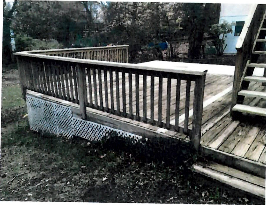
Style of picket railing in foreground to be extended around concrete in background