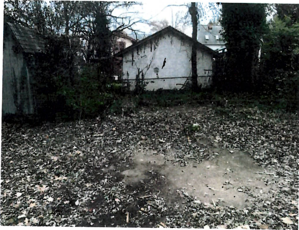
Existing rear chain link fence to be replaced with 6'0" flat-board wood fence