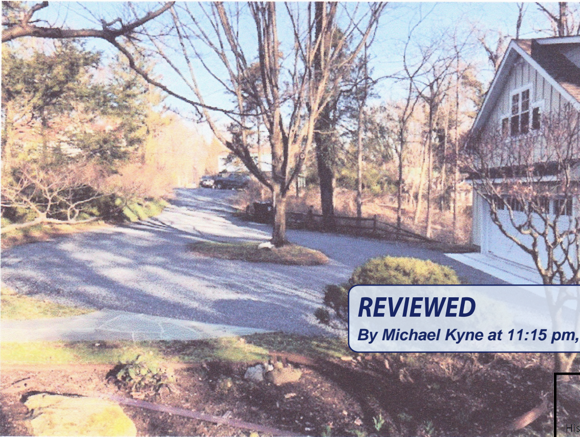
Driveway facing North.