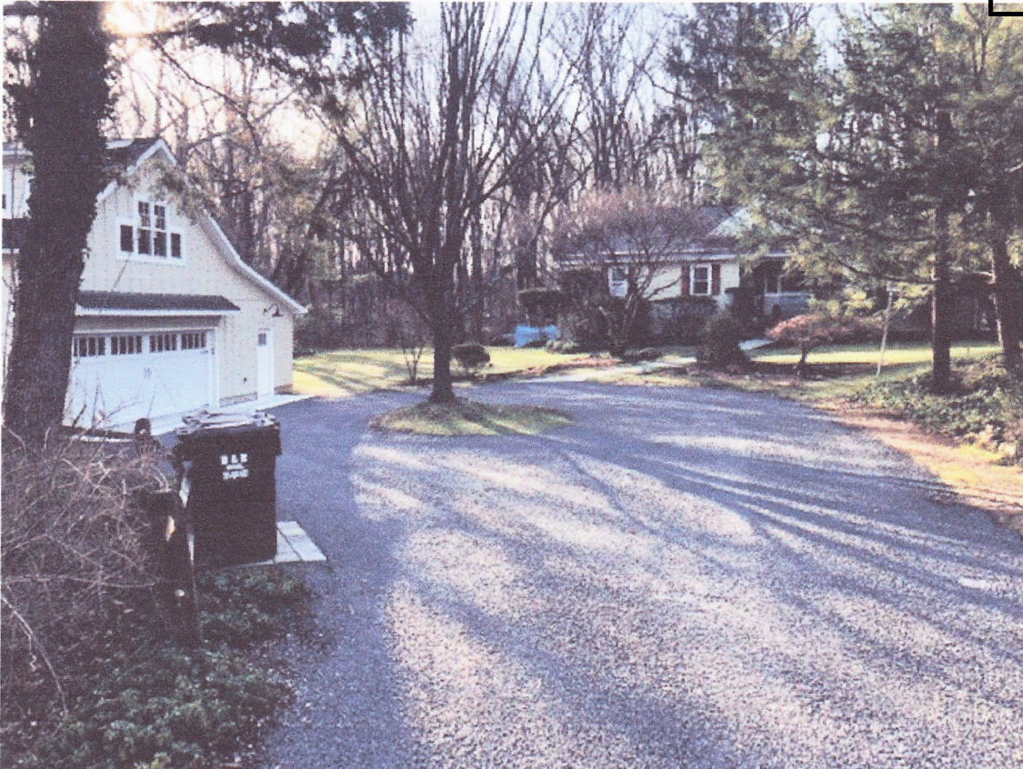
Drive facing South.