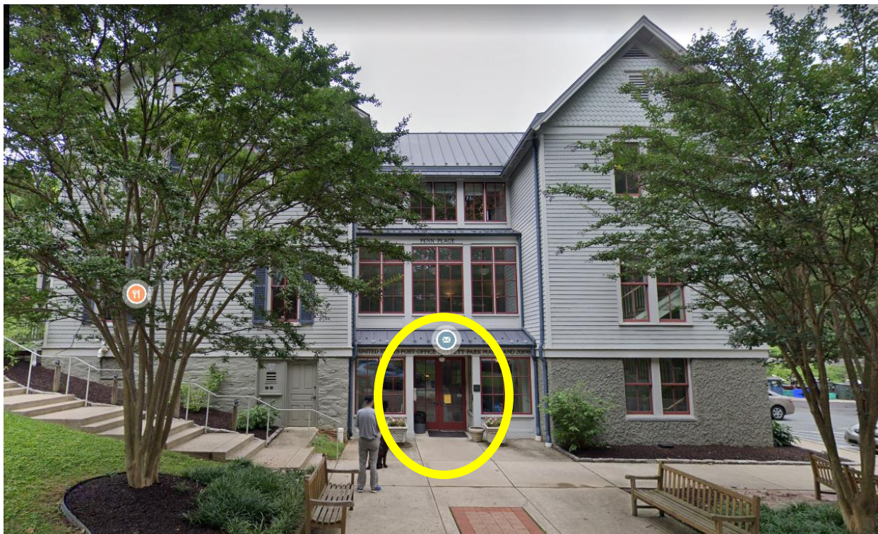
Figure 2: The subject property, the doors to be removed are circled in yellow.