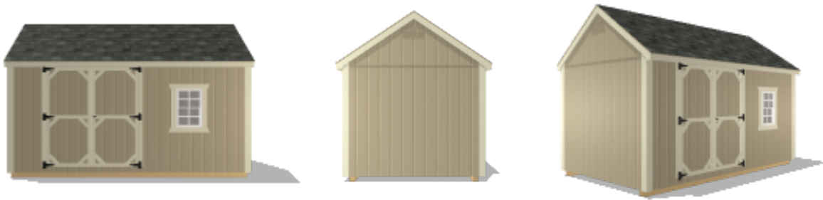
Figure C: Rendering of the shed showing the size, shape, appearance and color. Left: Front view showing the shed as will be seen from the back yard. Center: Side view of the shed; this is the profile of the shed that faces the street. Right: Quarter view of the shed as seen from the back deck of the house.

The work consists of installation of a wooden storage shed in the backyard of the property. The shed will have a footprint of approximately 8' x 16'. The siding will be painted wood with wooden trim painted in an accent color. The color of the shed will be "Almond", a dark beige, while the accent color will be white. The roofing will be gray shingles. This is to harmonize with the color of the existing house structure.