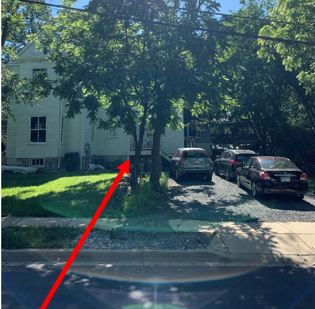
Black Walnut (American Elm to the right of the Black Walnut to remain)

By Dan.Bruechert at 4:46 pm, Jul 17, 2020