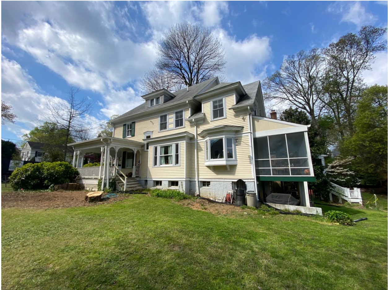
3713 Underwood Street – East Elevation

Application for Montgomery County Historic Area Work Permit (HAWP) Duke Schaeffer & Hannah Graae 3713 Underwood Street Chevy Chase, MD 20815