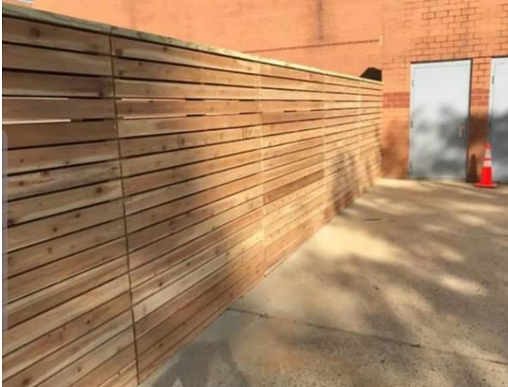
Figure 1: A precedent image of the proposed fence.

The applicant proposes to install 6' (six foot) tall horizontal board fence along the north property boundary. The fence is to the rear of the left-projecting bump out and will have a 4' (four foot) wide gate.