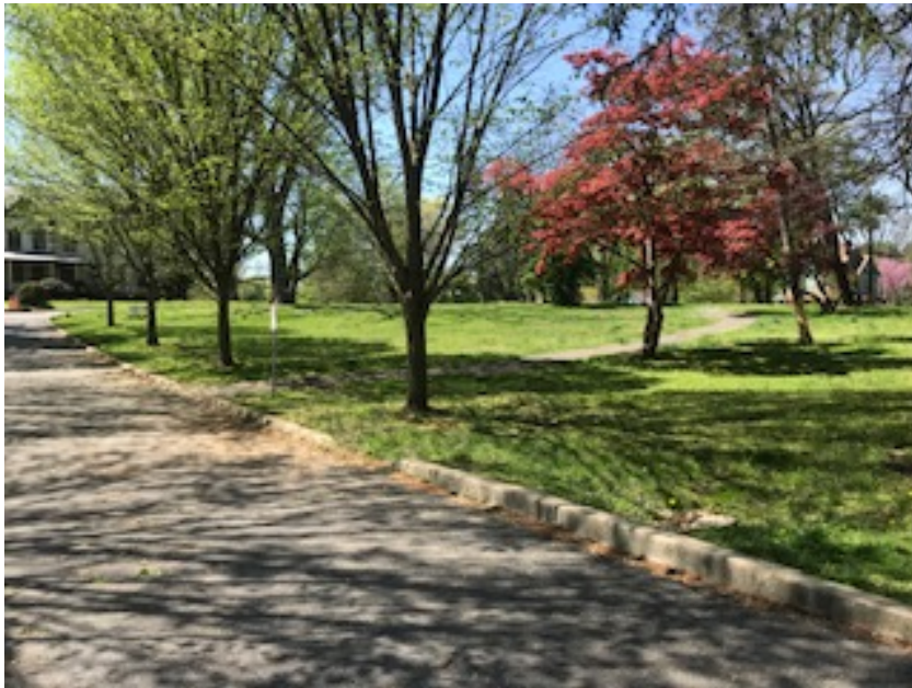
Moving up driveway, approaching sidewalk leading to where signs are proposed for installation.