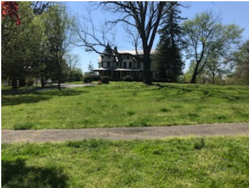
View looking S showing where signs are proposed to be installed (opposite side of sidewalk, in lawn immediately adjacent to walk).

REVIEWED By Dan.Bruechert at 2:19 pm, Aug 31, 2021