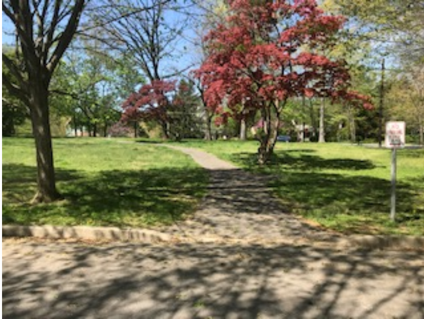
View looking W from driveway at beginning of sidewalk toward location to left of sidewalk and past red tree to proposed signage location.