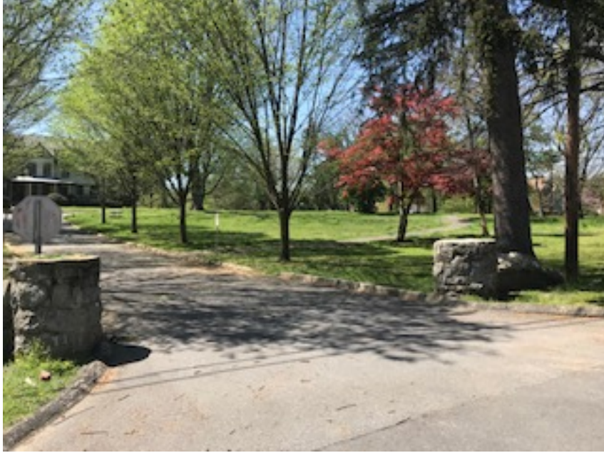
Front drive entrance to Warner Special Park looking SW. Proposed sign location to right of red tree on opposite side of walk, immediately adjacent to walk. Manor house in background to left.