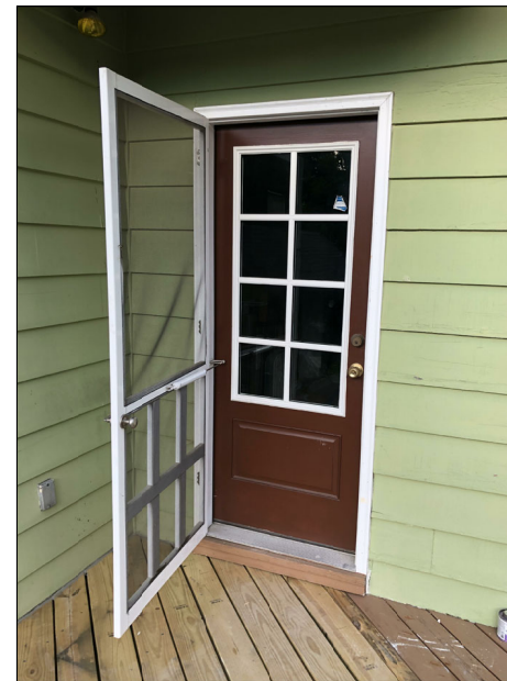
PATIO DOOR TO BE REPLACED.