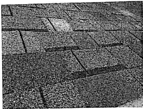
Current CertainTeed Horizon "shingles" (product discontinued)

We have enclosed several attachments (listed at the end of this letter), including notice of approval for this project by the Maryland Historical Trust for a Heritage Structure Rehabilitation Tax Credit. From correspondence with that office, we chose a replacement roof material/shingle that closest matches our existing roof and meets the Trust's criteria for in-kind replacement. CertainTeed Patriot shingles would be an appropriate replacement for the CertainTeed Horizon "shingles" currently on the roof. See photographs below: