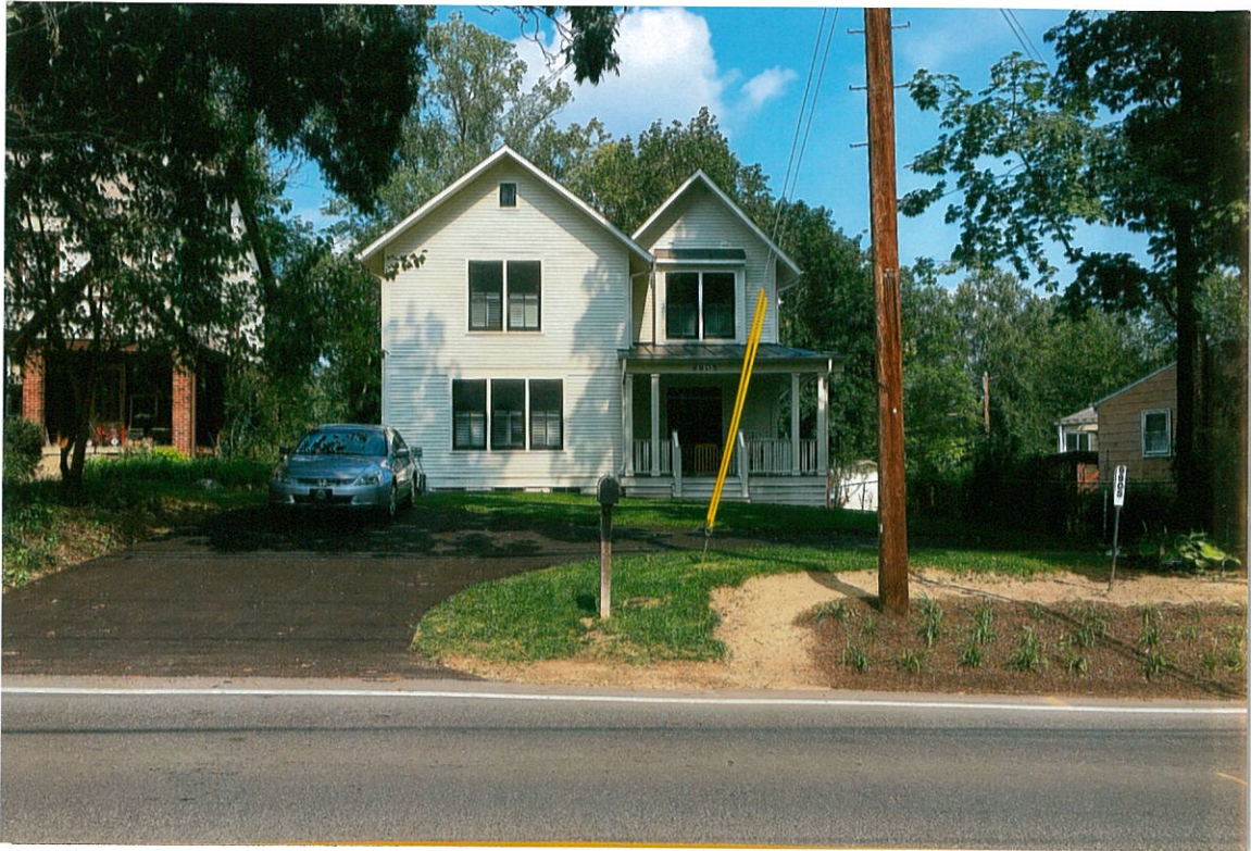
Detail: Front of 9905