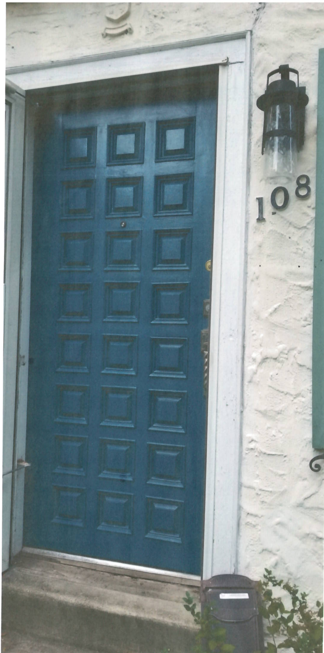
existing external front door