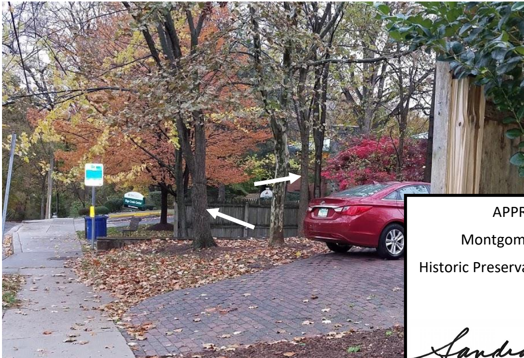
Detail: View from adjoining property, white arrows show trees to be removed

APPROVED Montgomery County Historic Preservation Commission Sandra L. Heiler