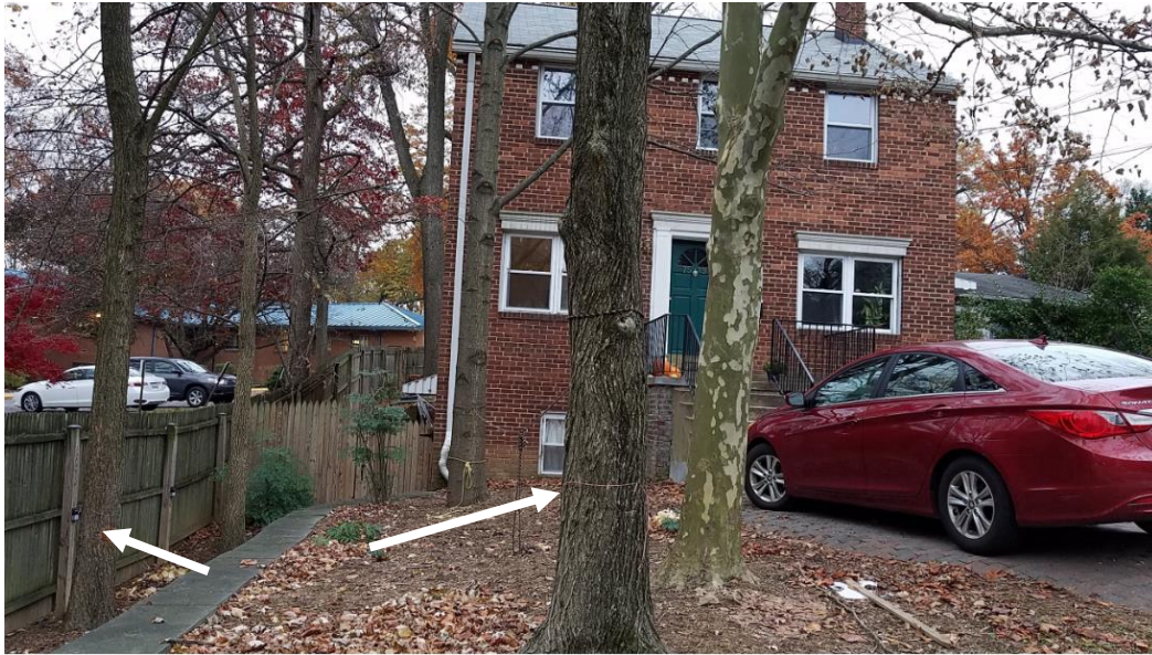
Detail: Front of property from right of way, white arrows show trees to be removed