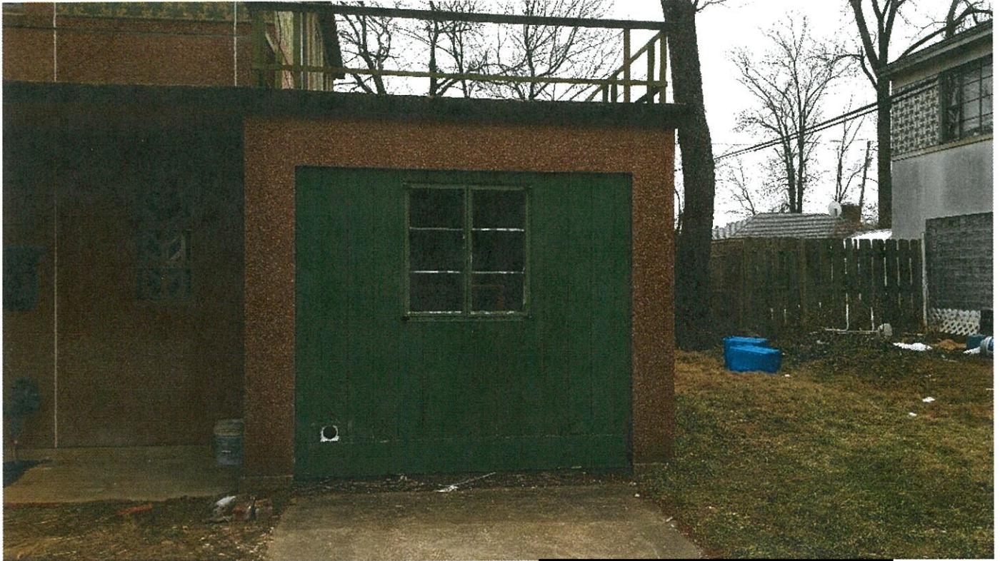
9925 Sutherland Road Garage Front

Date: Monday, February 4, 2019, 12:00 PM EST