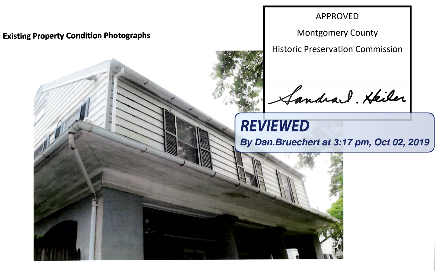
Photo 3. 08/05/19. Front (north) elevation. Project area. Left close-up showing aluminum siding to be removed; shutters to be restored and painted; wood porch ceiling, trim, and molding to be repaired and painted; aluminum gutters and downspouts to be repaired.