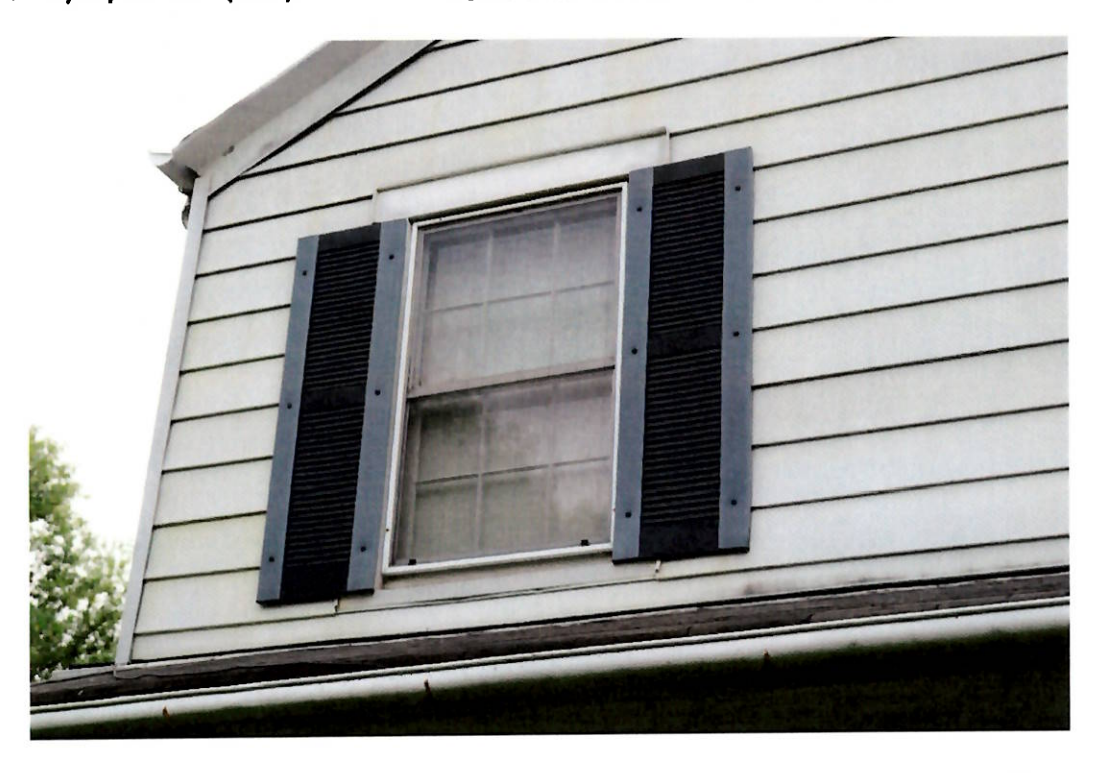
Photo 10. 08/05/19. Side (east) elevation. Project area. Left close-up showing aluminum siding to be removed; non-original shutters to be replaced and painted; aluminum gutters to be repaired.

Photo 9. 08/05/19. Side (east) elevation. Project area. Opposite 18 Oxford Street.