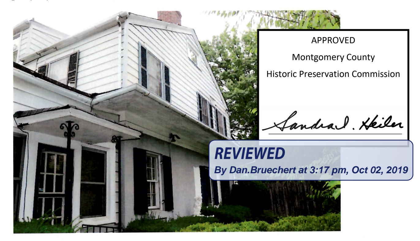
Photo 9. 08/05/19. Side (east) elevation. Project area. Opposite 18 Oxford Street.