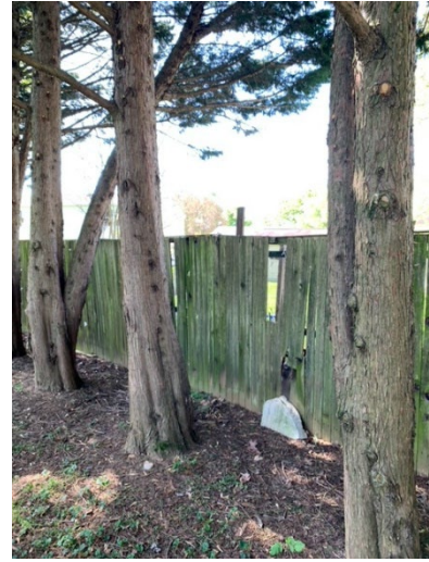
East and South fences