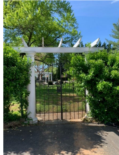
Northern fence with gated arbor