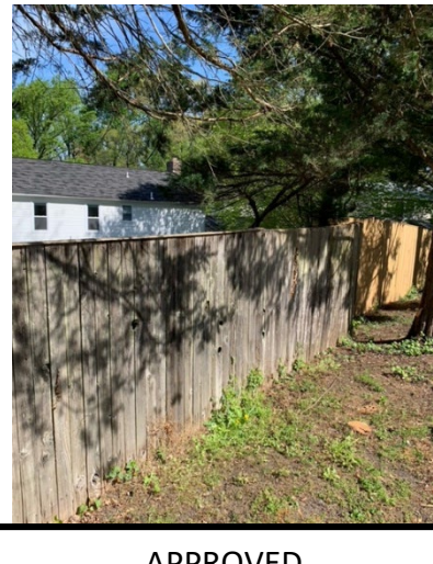
Southwest corner and West fences