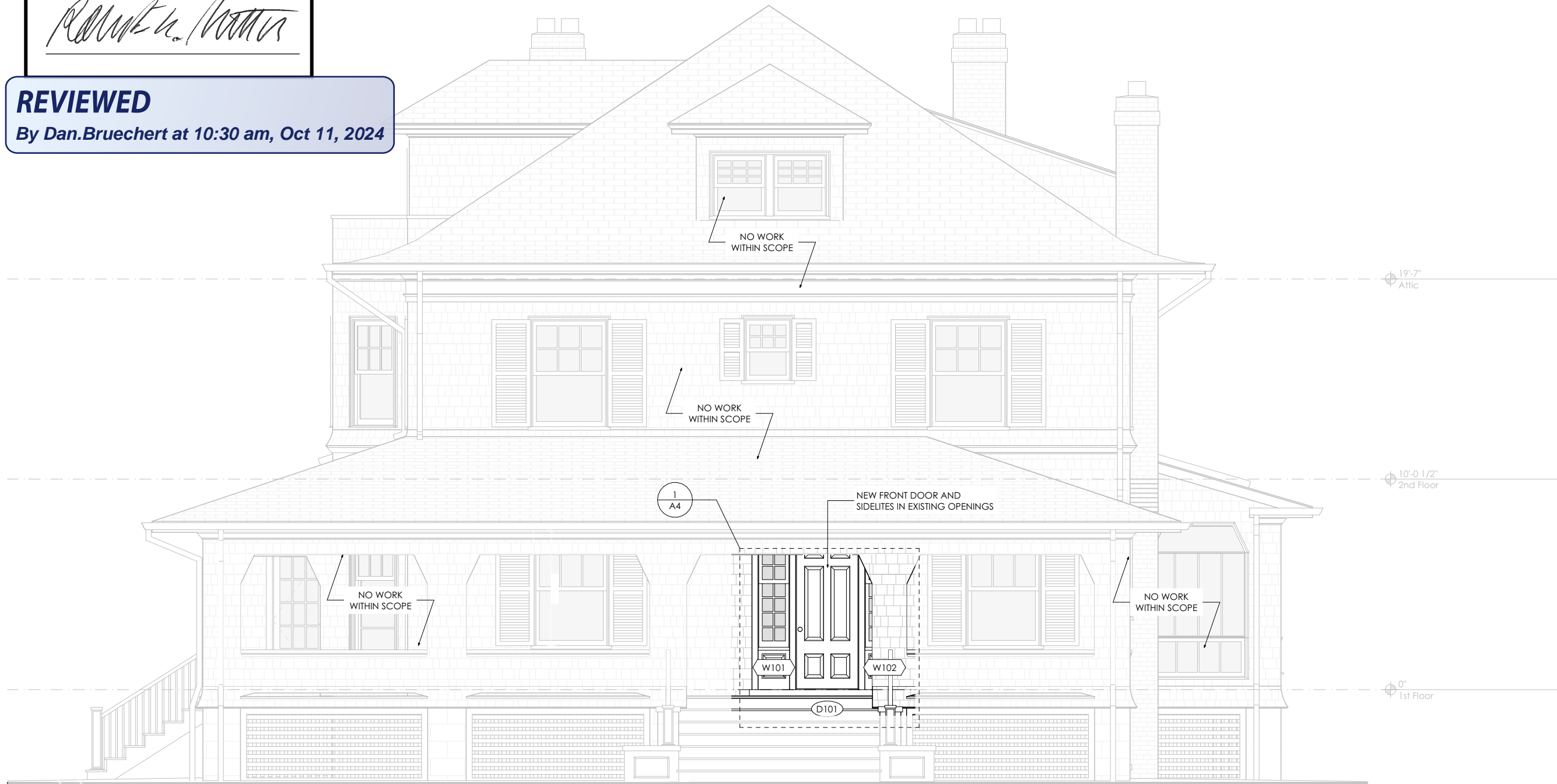
1 Front Elevation 3/16" = 1'-0"

REVIEWED By Dan.Bruechert at 10:30 am, Oct 11, 2024