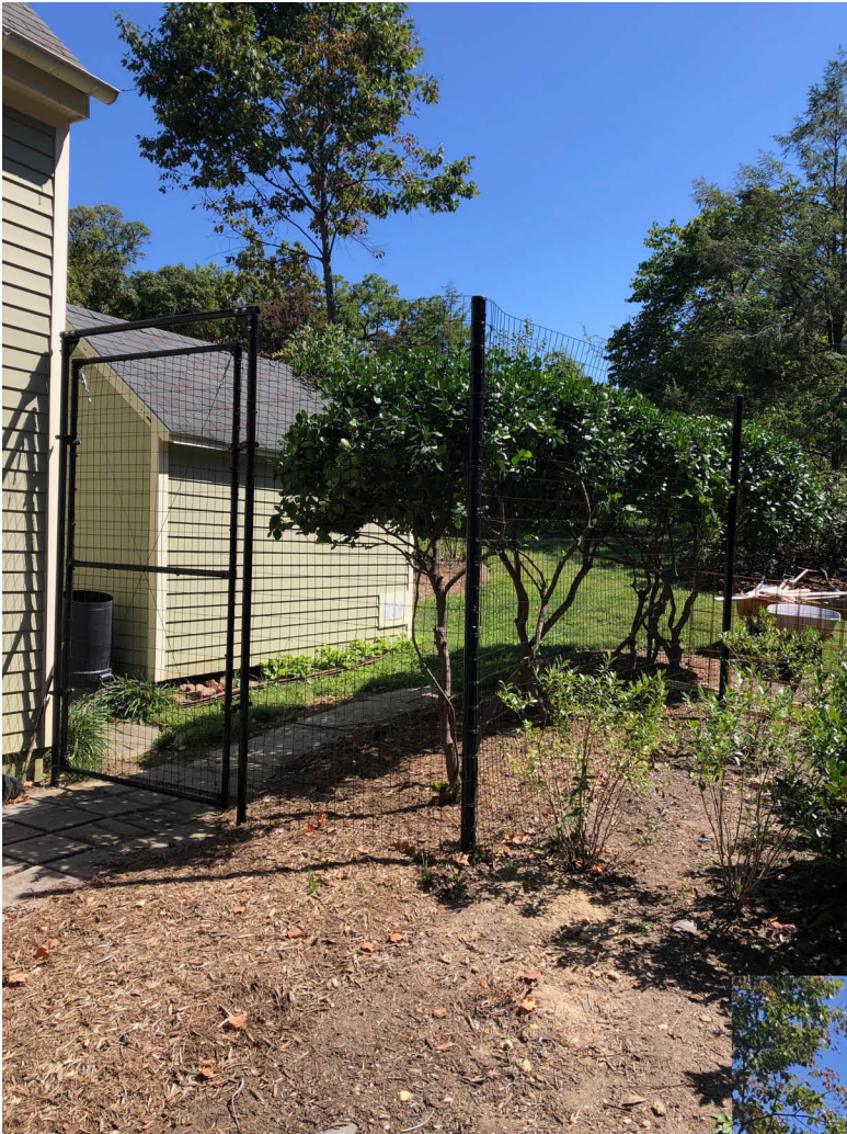
Proposed 8 ft fence style and gate