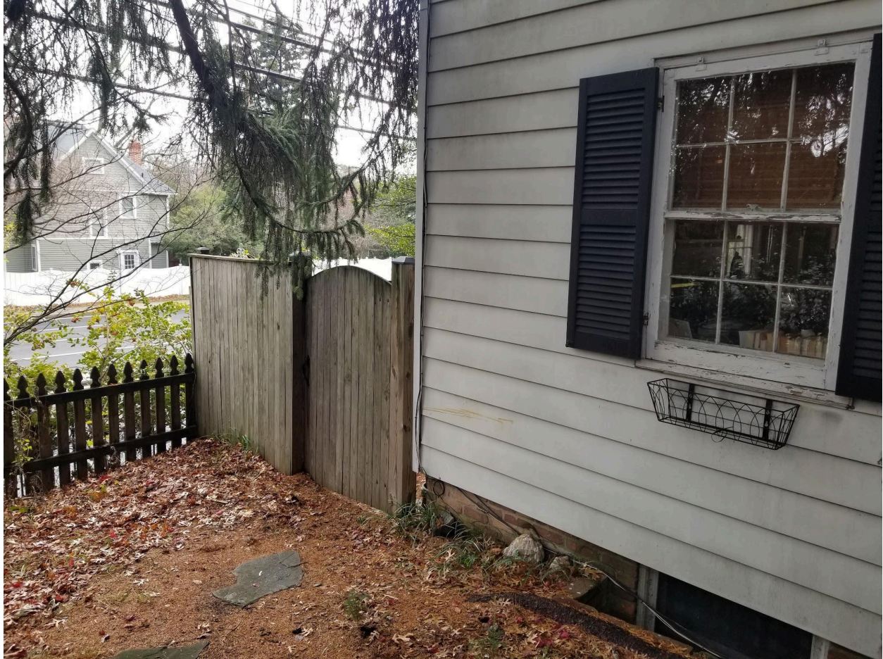
Existing solid wood fence gate from the north