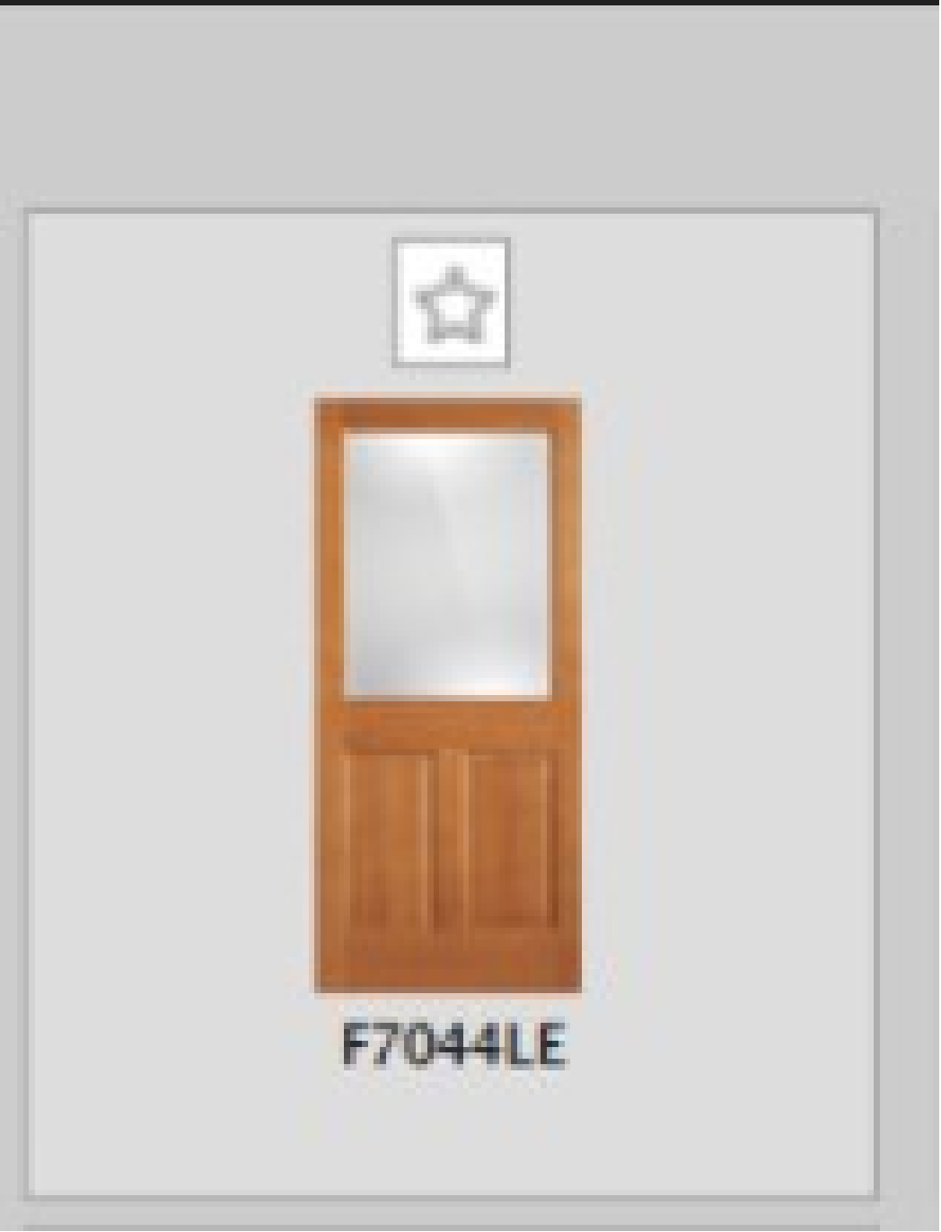
Reeb wooden door. Fir