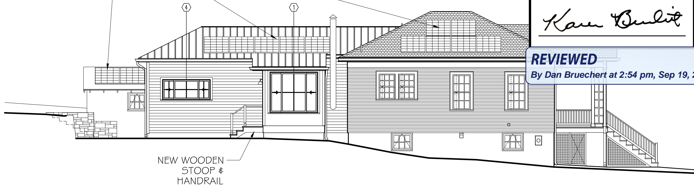
2 EAST ELEVATION